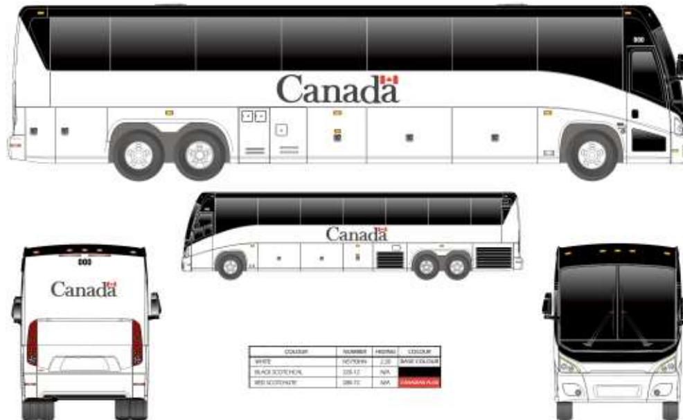
FIGURE 1 - LOCATION OF DECALS

This figure is only a visual representation of the decals and their position. 3.19 Identification - The vehicle information (manufacturer's name, model, Vehicle Identification Number (VIN) and the GAWR and GVWR ratings) must be permanently marked in a conspicuous and protected location.