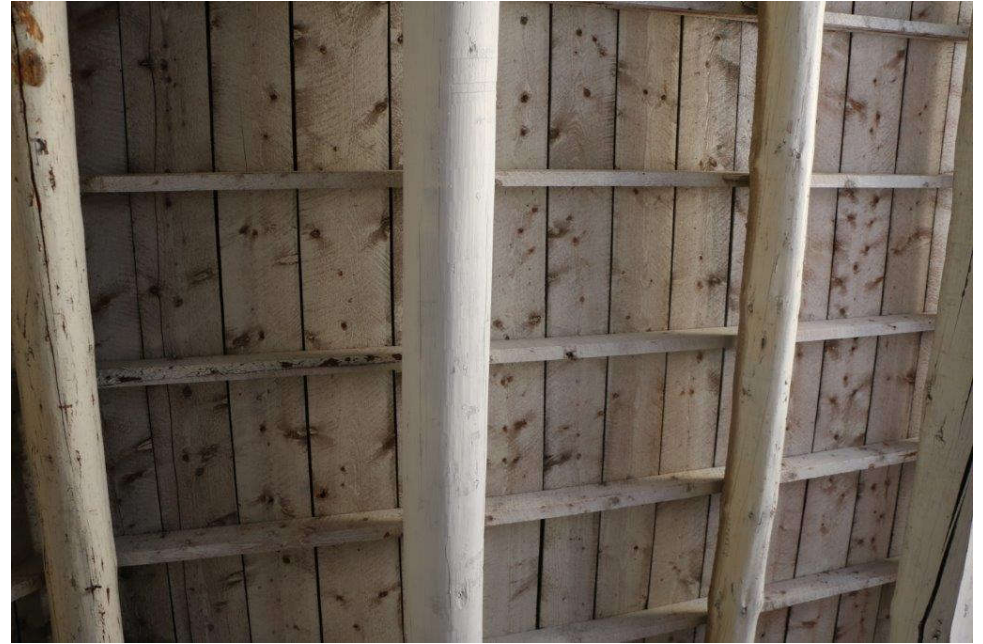
Stable – Interior exposed ceiling structure (March 2019)