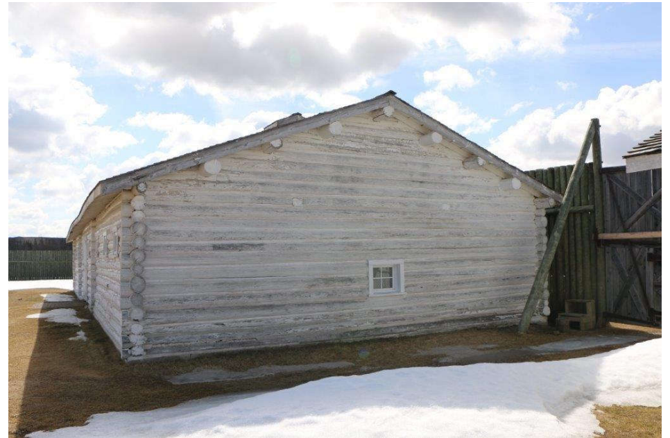
Stable – Exterior Elevations & soffit/fascia closeup at gable end. (March 2019)