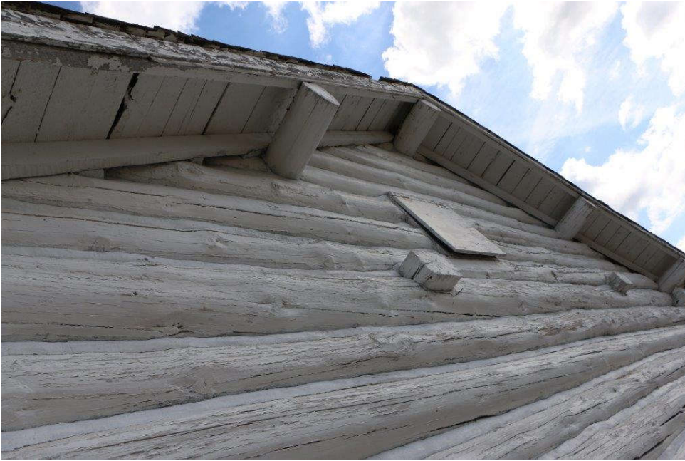
Courthouse/Granary – underside of soffit at gable end. (March 2019)