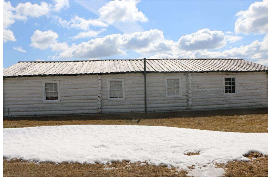
NCO Barracks – Exterior Elevations (March 2019)