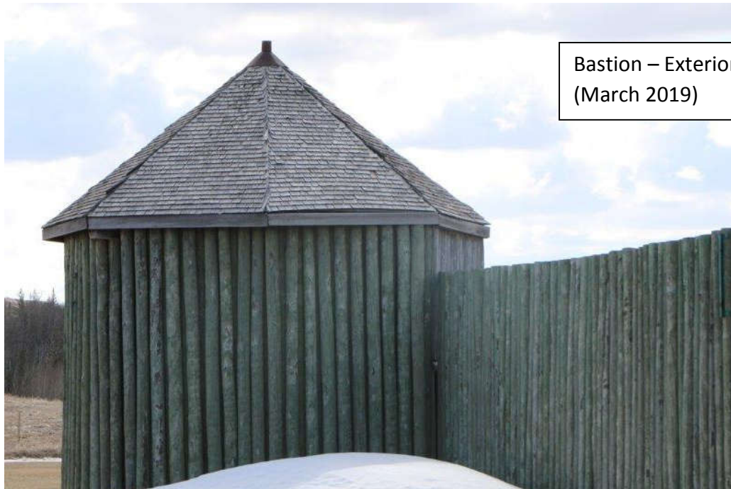
Bastion – Exterior Elevations (March 2019)