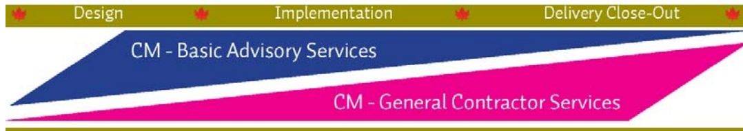
Figure 1 Level of Effort