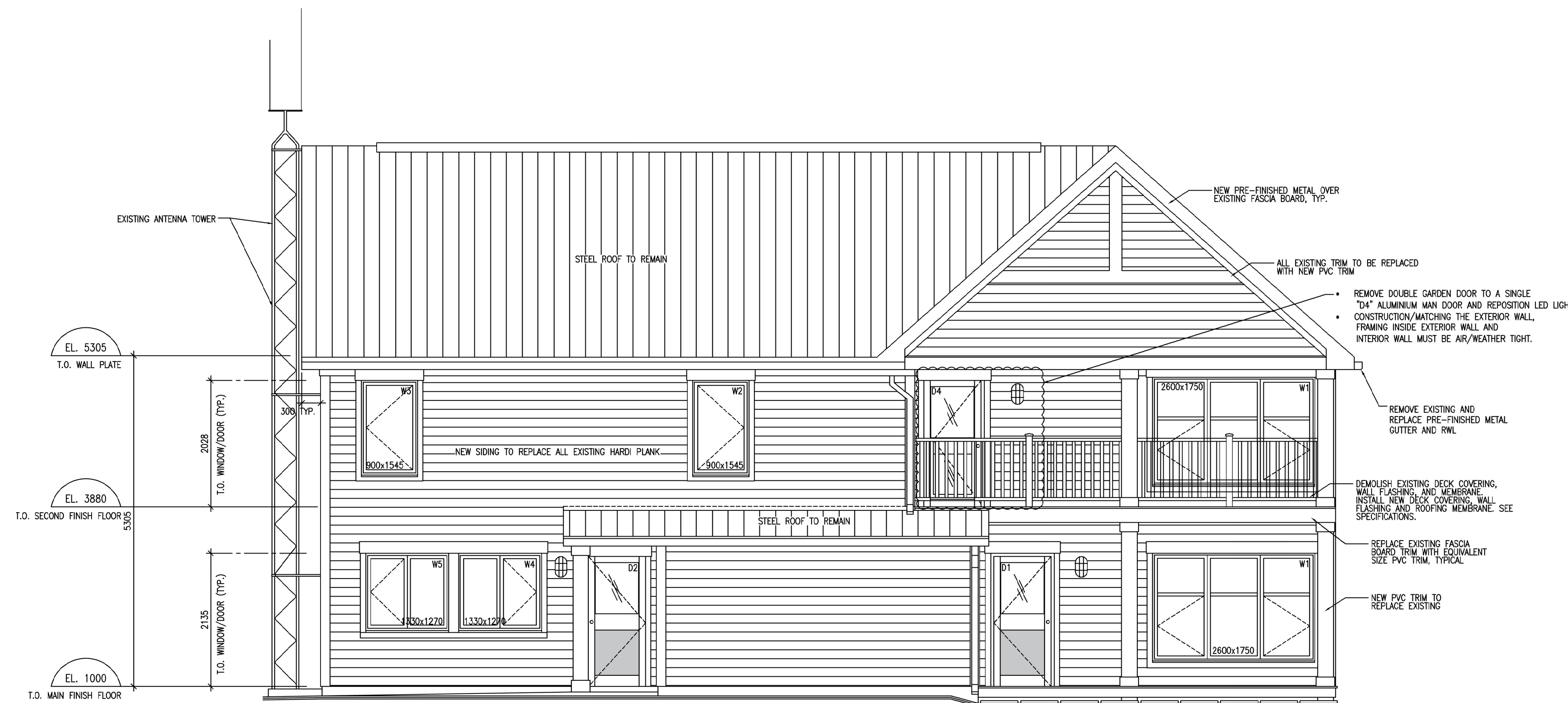
1 SOUTH ELEVATION SCALE : 1:50

NOTE: 1. REMOVE AND REINSTATE ALL EXTERIOR LIGHTING, SIGNAGE, LOUVRES, ELECTRICAL CONDUIT, SATELLITE TOWER AND ANY SERVICES, TYPICAL. 2. REMOVE AND SALVAGE EXISTING TRIM AND VENTS FOR REINSTALLATION AS PER DETAIL 3/401.