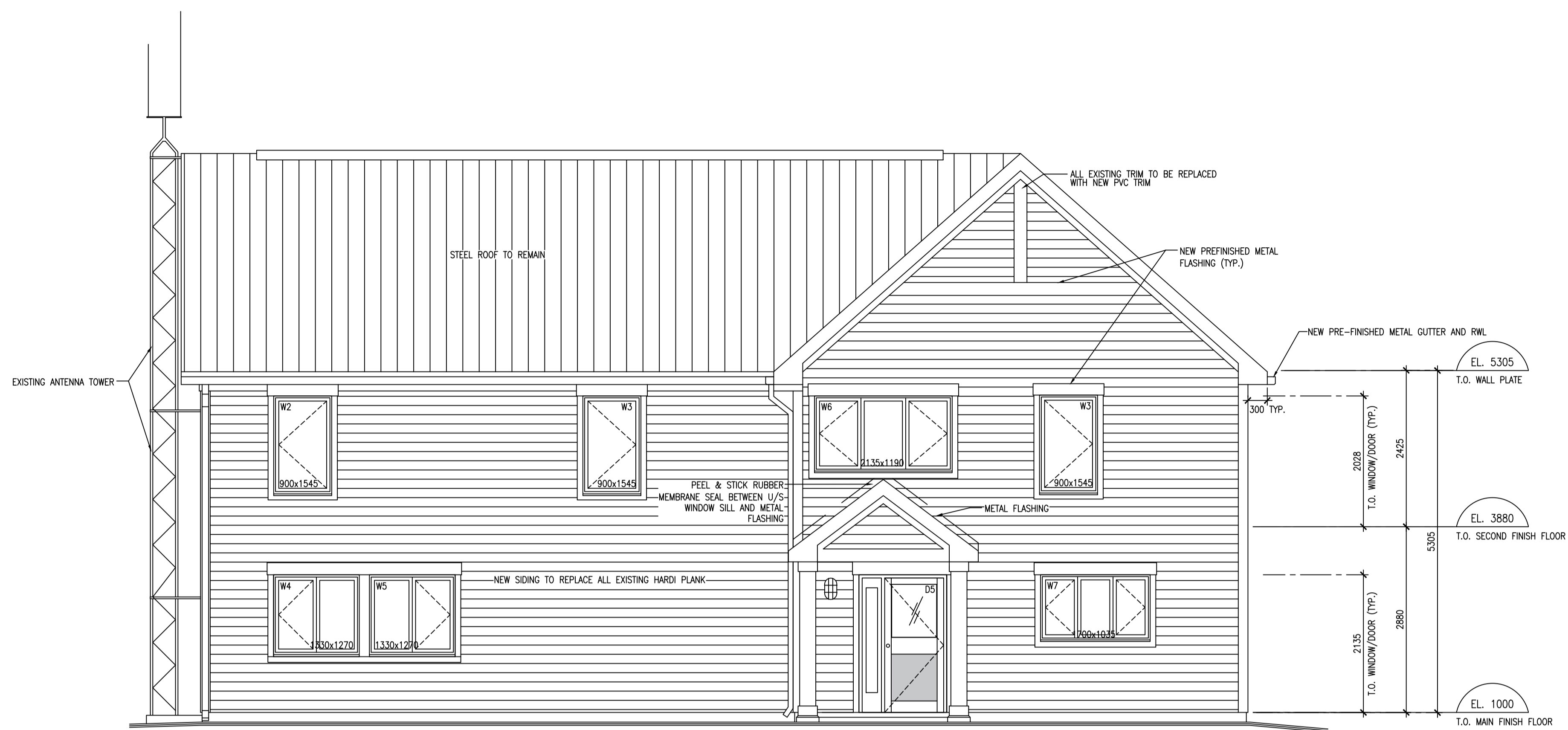
1 NORTH ELEVATION 201302 SCALE : 1:50 0m 1m 2m 3m 4m 5m

NOTE: 1. REMOVE AND REINSTATE ALL EXTERIOR LIGHTING, SIGNAGE, LOUVRES, ELECTRICAL CONDUIT, SATELLITE TOWER AND ANY SERVICES, TYPICAL. 2. REMOVE AND SALVAGE EXISTING TRIM AND VENTS FOR REINSTALLATION AS PER DETAIL 3/401.