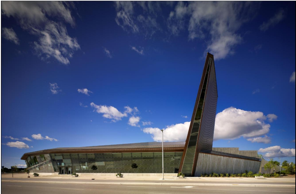
Canadian War Museum

armed conflict. The theme of the museum's architectural design, "regeneration," evokes not only the impact of war on land, but also nature's ability to regenerate and to accommodate the physical devastation brought by human conflict. A low-lying building that merges into the surrounding landscape, the Canadian War Museum features a gently sloping roof covered with vegetation and copper sheathing, as well as a rooftop memorial garden.