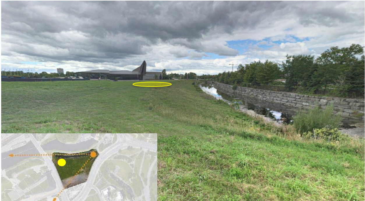
View of Monument site towards Canadian War Museum