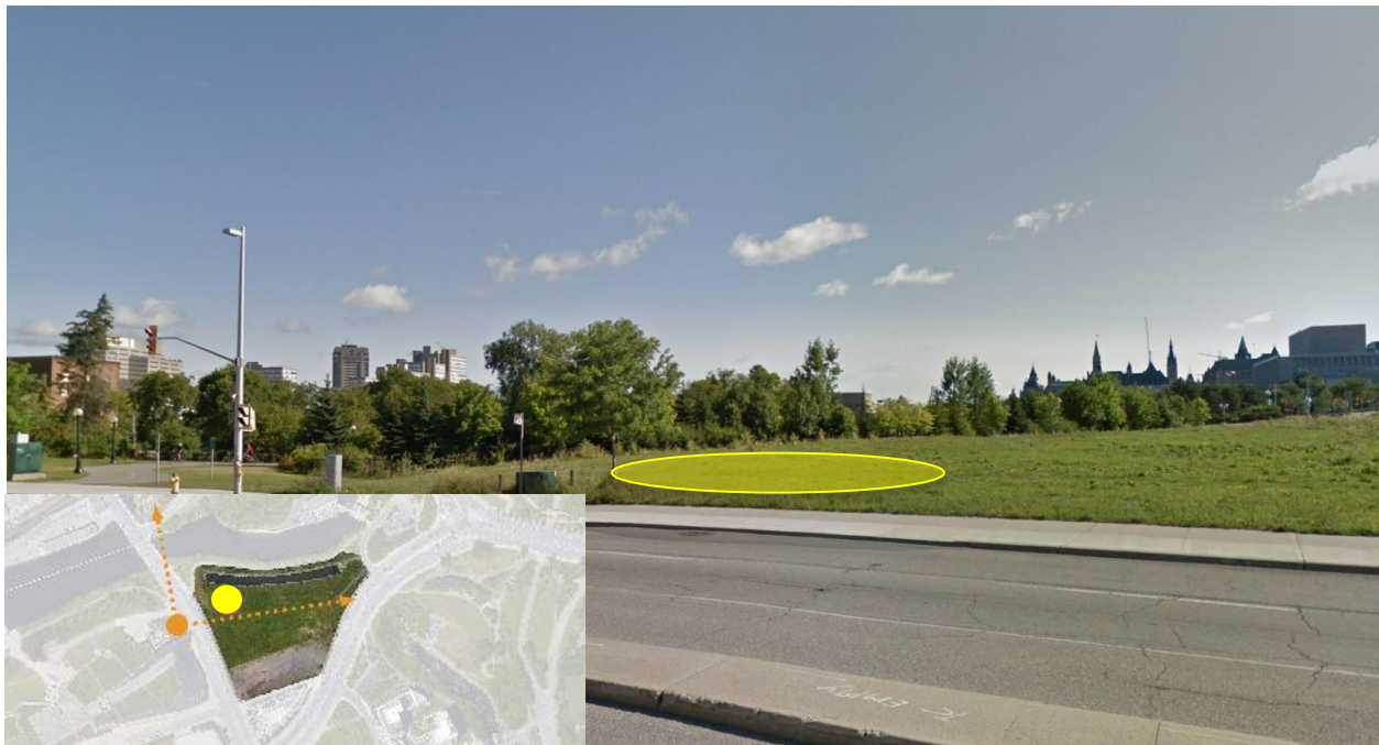
View of Monument site towards Parliament Hill