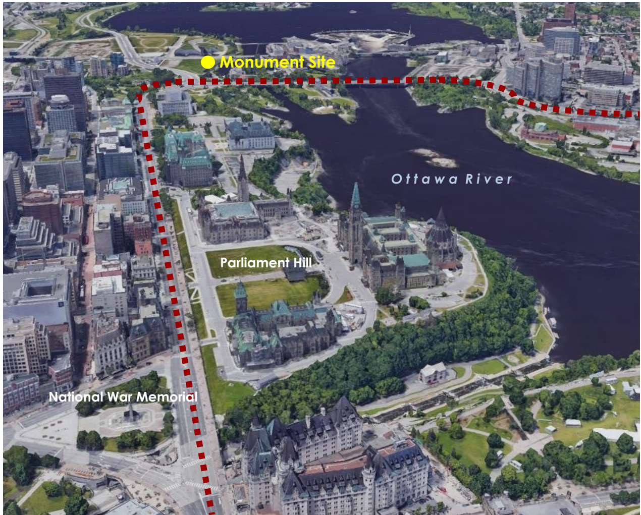
View down Wellington Street/Confederation Boulevard toward Monument site