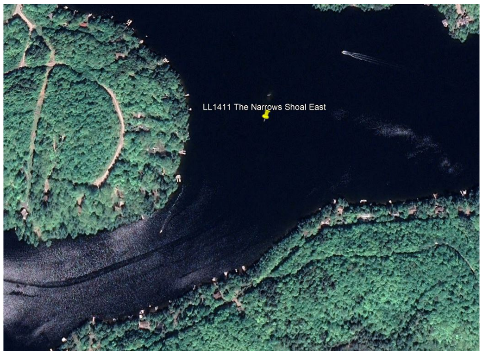
Figure 2: LL1411 The Narrows Shoal East