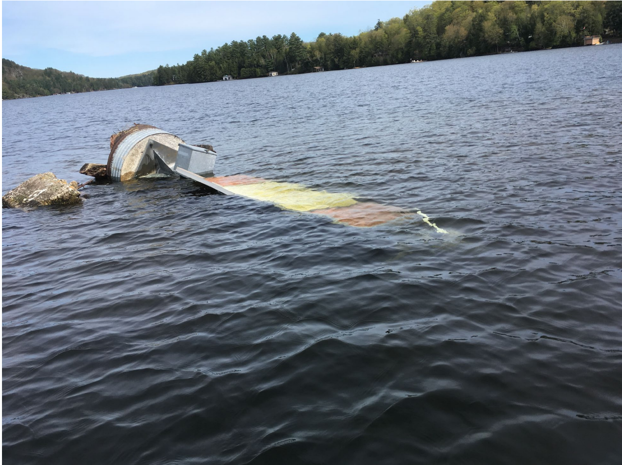
Figure 7: LL1411 Existing Nav-aid (to be removed)