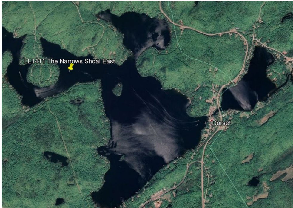
Figure 1: LL 1411 The Narrows Shoal East 45°15'11.00"N, 78°55'38.00"W