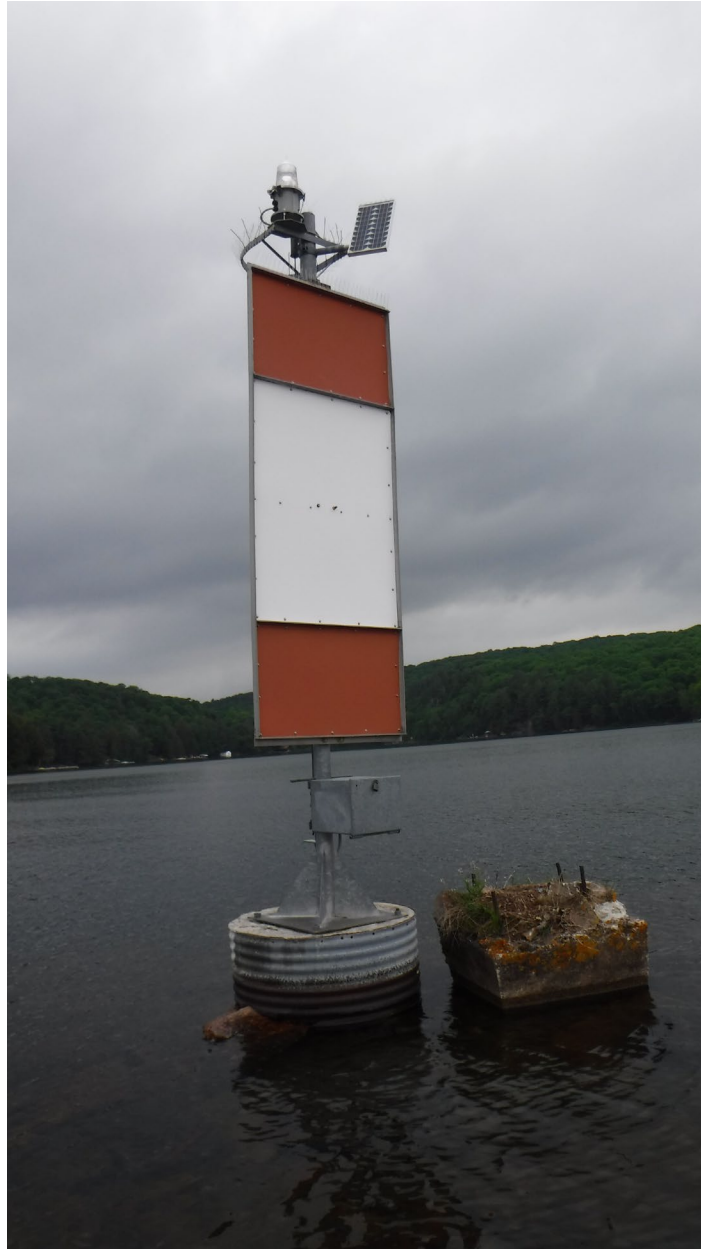
Figure 8: LL1411 Showing Existing Tower and Foundation Before Failure