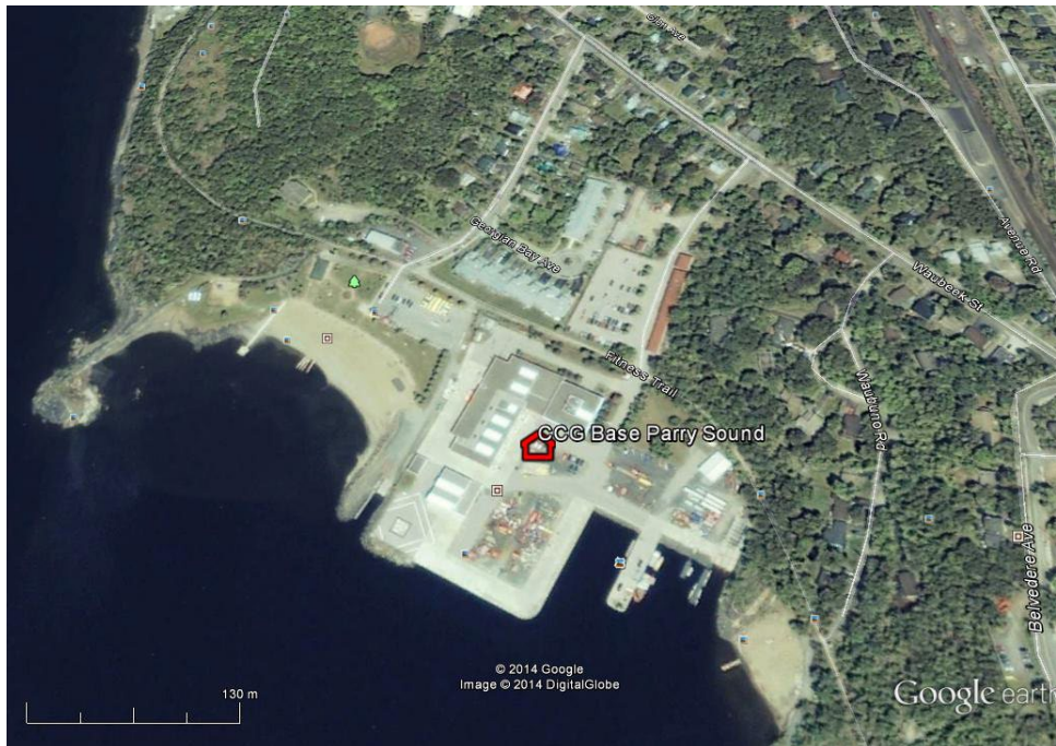
Figure 6: Coast Guard Staging Area