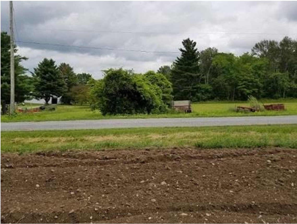
View to the EAST