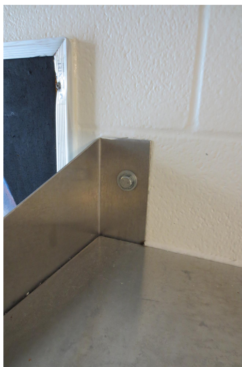
Above: Existing Bed (left) and Shelf (right)Fastener in Assiniboine Unit. New fasteners for new furniture to match