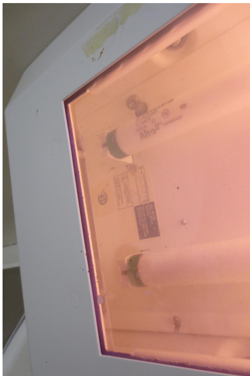
Above: Existing Light Detail