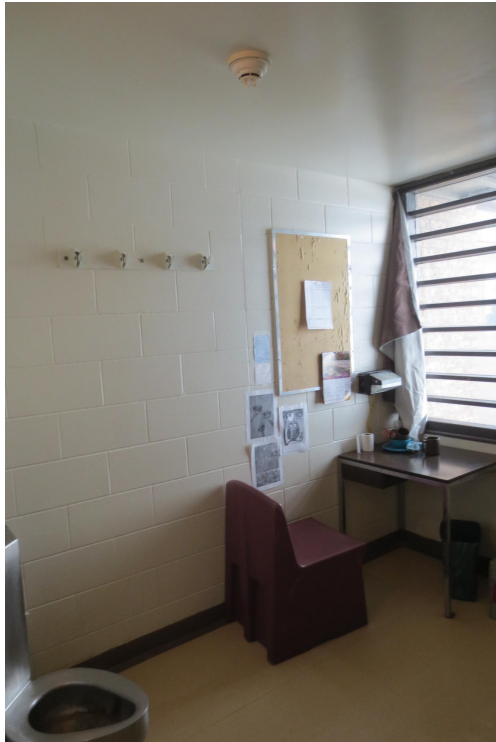
Above: Cell Wall