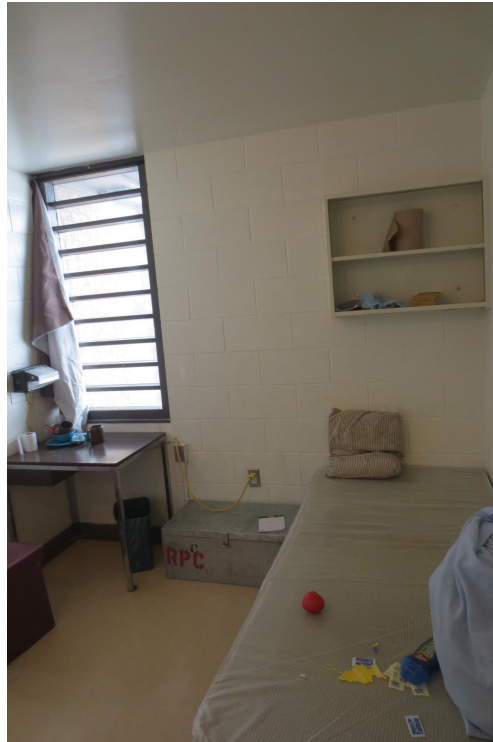
Above: Cell Wall