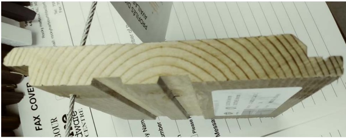
Figure 2. SIDING PROFILE PICTURE