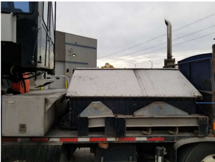
Photo of the present standard weight box with its cover

Picture of the present weight standards box and its cover.