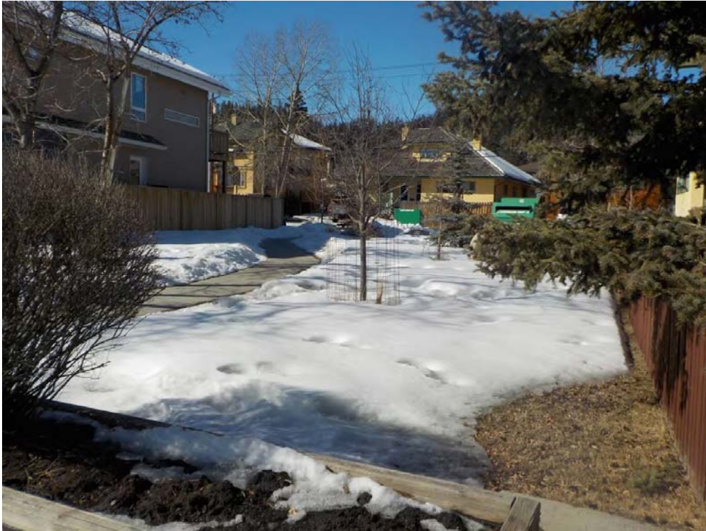
Front (From Patricia Street)