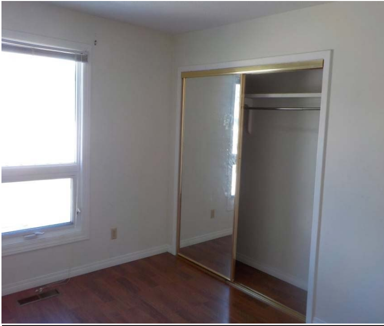
Main Floor Bedroom 2