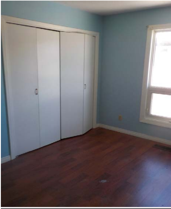
Main Floor Bedroom 3