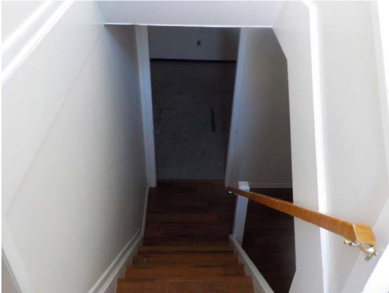
Main Floor Hallway to Bedrooms and Bathroom