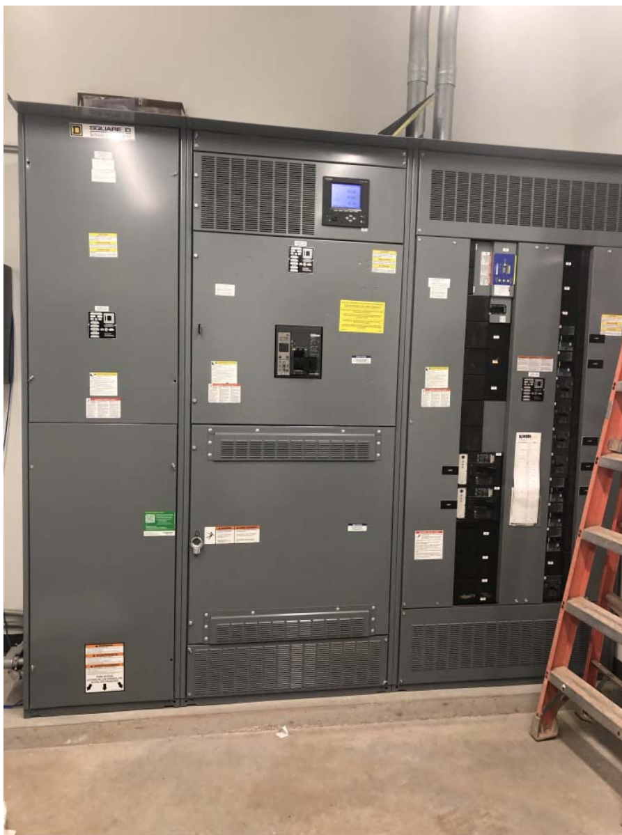
Visitor Centre Main Switchboard_ 2