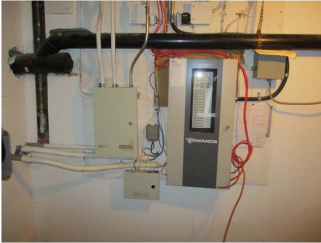
House Existing Fire Alarm Panel

Buyer ID - Id de l'acheteur PWC033 CCC No./N° CCC - FMS No./N° VME