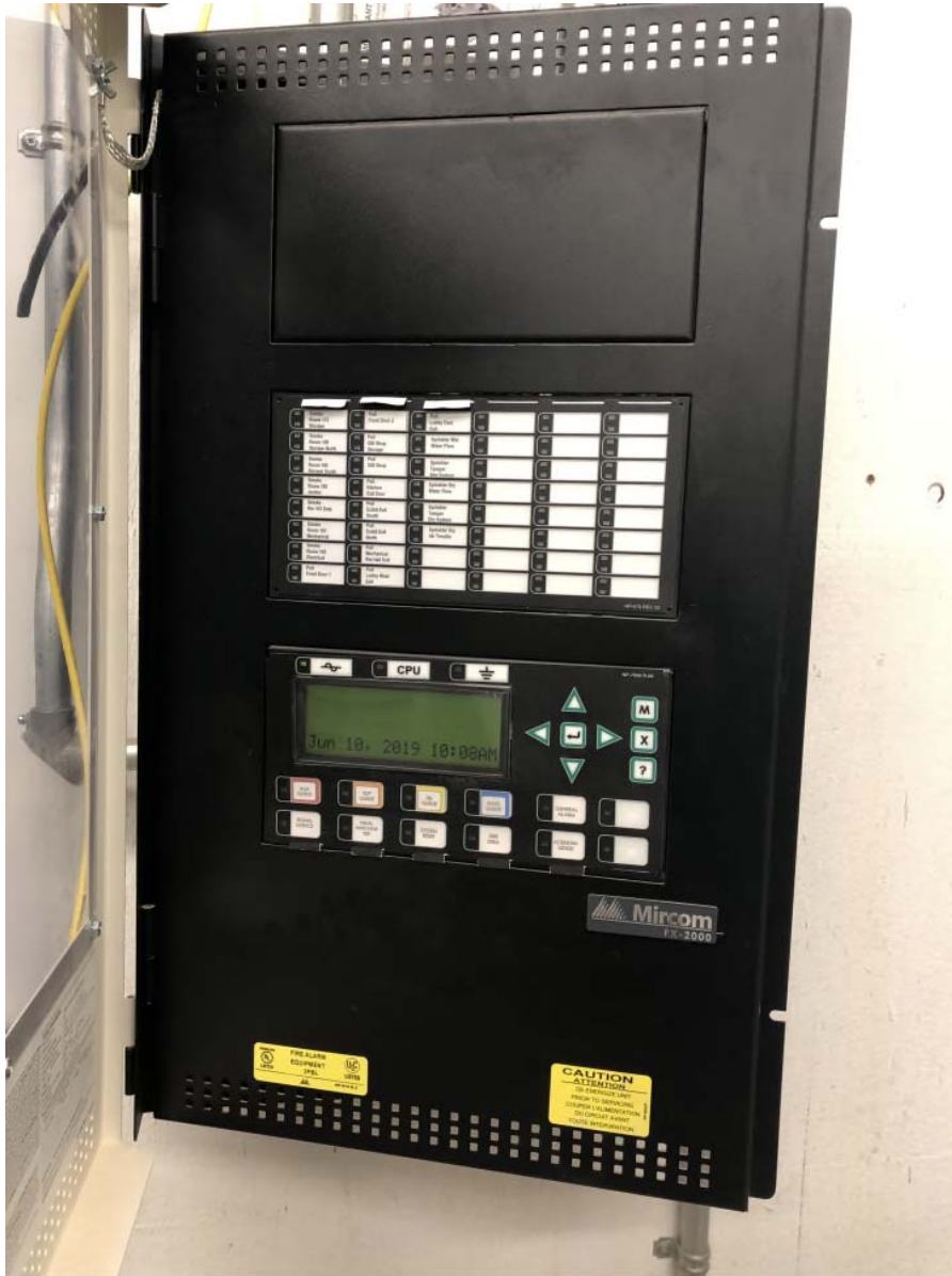
Visitor Centre Existing fire Alarm Panel