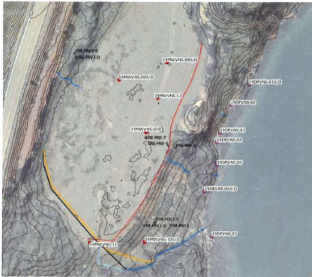
2019 Venus Mine Drive Point and Monitoring Well Installations