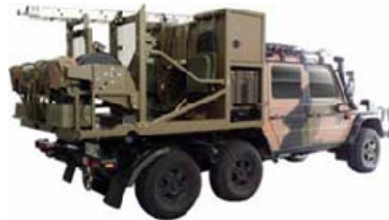
Examples of allied Nations Cable Layer Special Equipment Vehicle (SEV) Kits