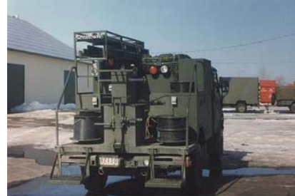
Cable Laying Variant.