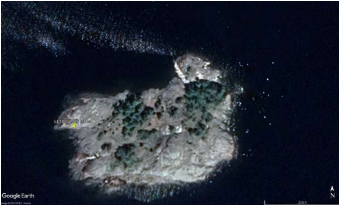
Figure 2: LL1027 Mills Island