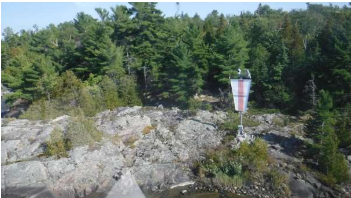
Figure 8: LL1029.5 Decelles Island Rear Range – Helipad to be placed to the left of the tower, new tower to be placed directly behind existing tower