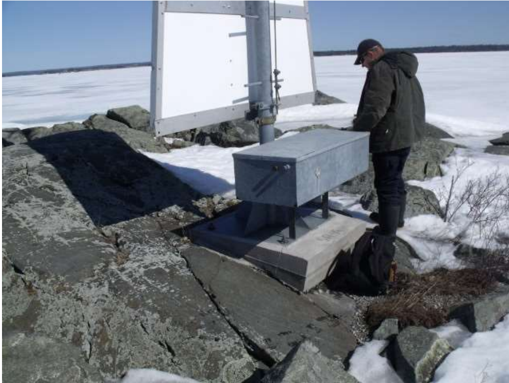
Figure 9: LL1029 Decelles Island Front Range – Tower to be placed in front of existing tower (where shadow is shown in photo) and old foundation removed after commissioning of new tower