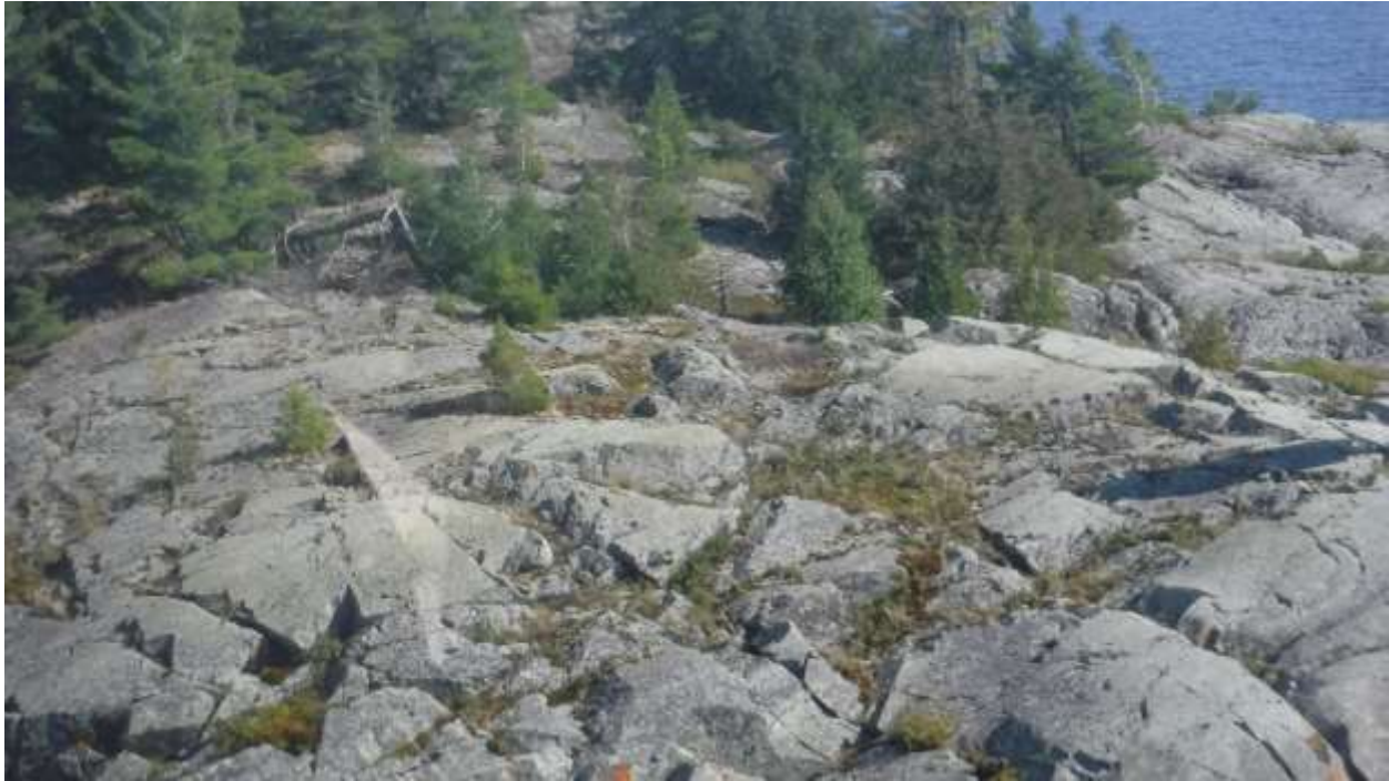
Figure 7: LL1027 Mills Island - Terrain at proposed helipad location