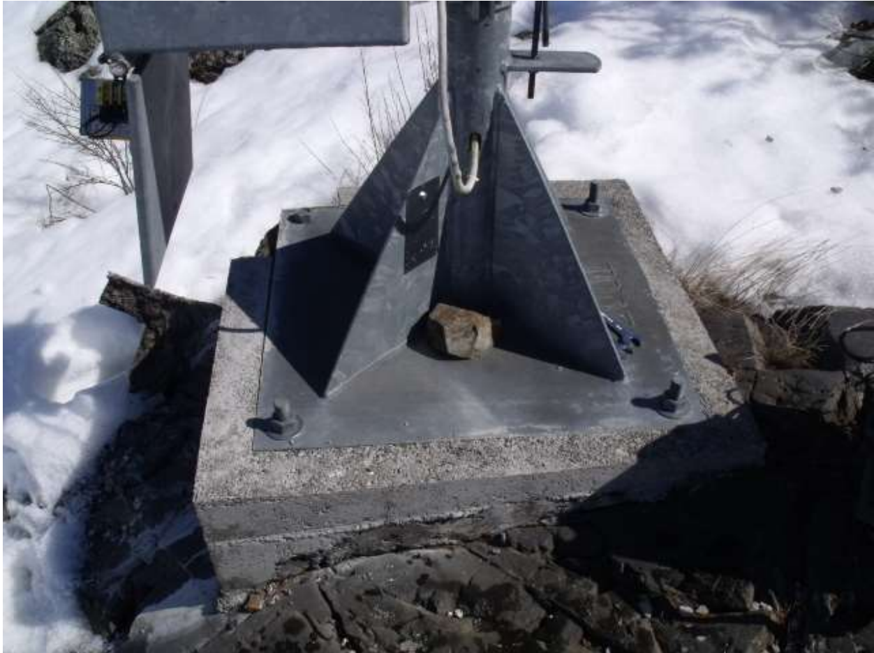
Figure 10: LL1029.5 Decelles Island Rear Range Existing Foundation