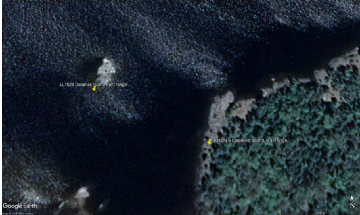
Figure 3: LL1029 and LL1029.5 Decelles Island Range