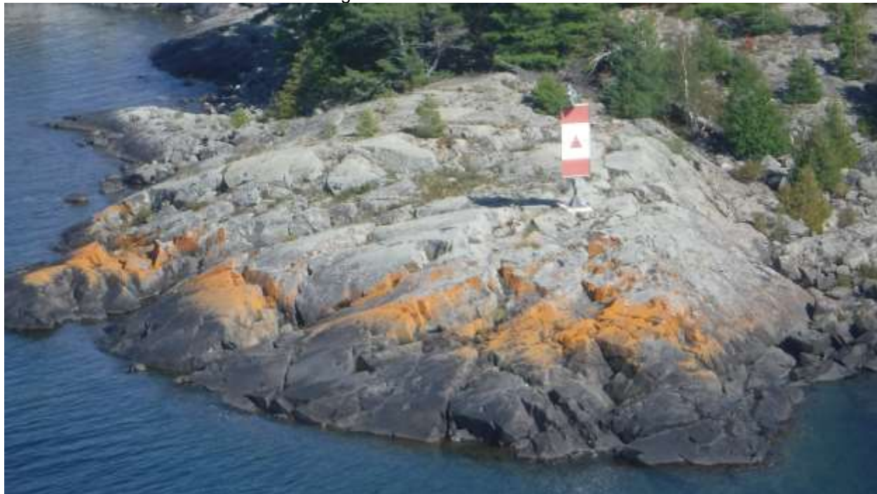
Figure 6: LL1027 Mills Island – Helipad to be placed behind new tower, which will be placed directly adjacent to the existing tower