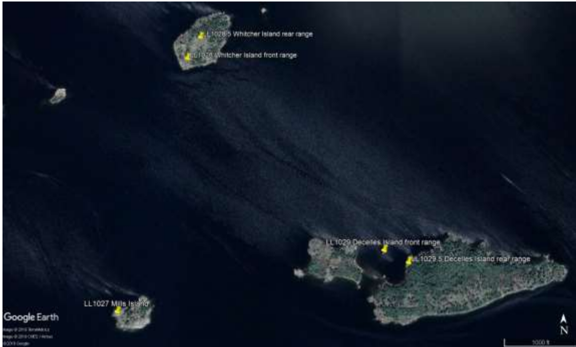
Figure 1: Overall Site Map