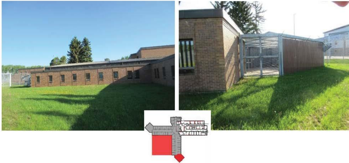
South Yard Segregation Unit Exercise compound