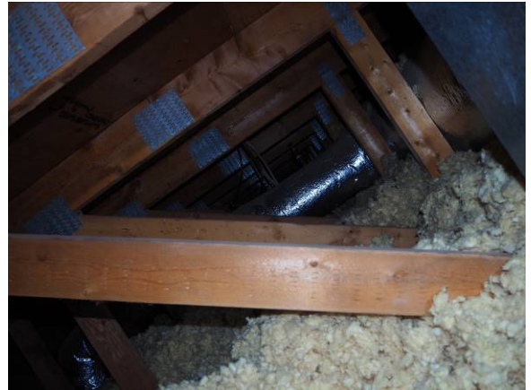
Attic below existing MUA-1