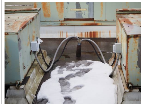
Existing F-15, F-16 (view 3)