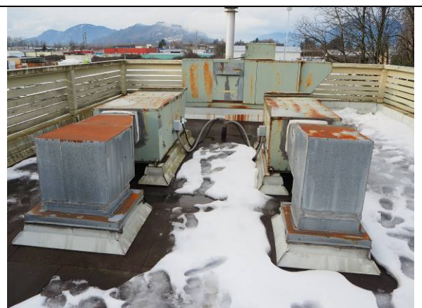
Existing F-15, F-16 (view 4)