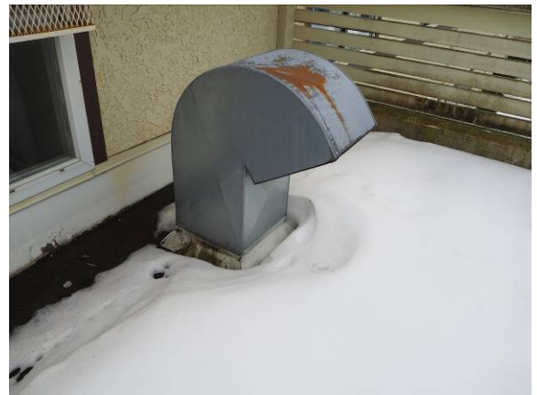
Existing Gooseneck 2