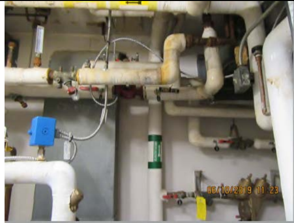
Existing Pumped HWS and R circuit and CV to HC-2