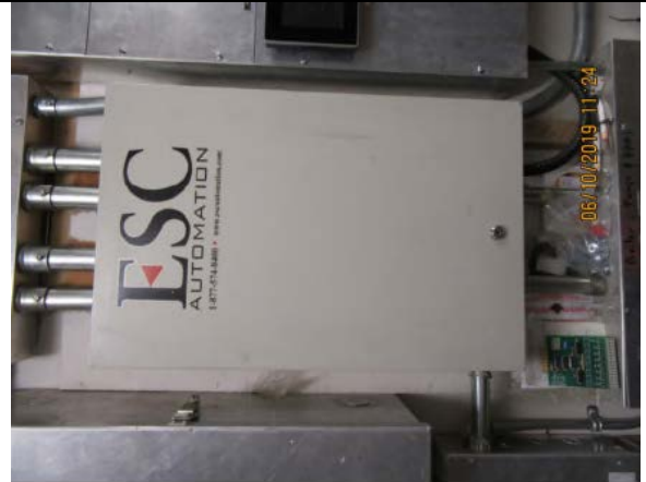
Existing Building Automation System