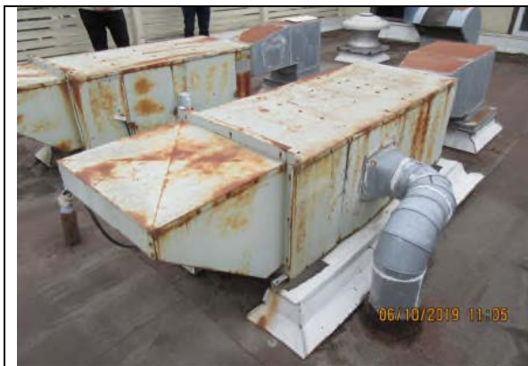
Existing F-15, F-16 (view 1)