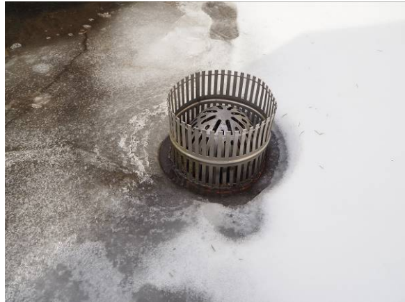
Existing Roof Drains