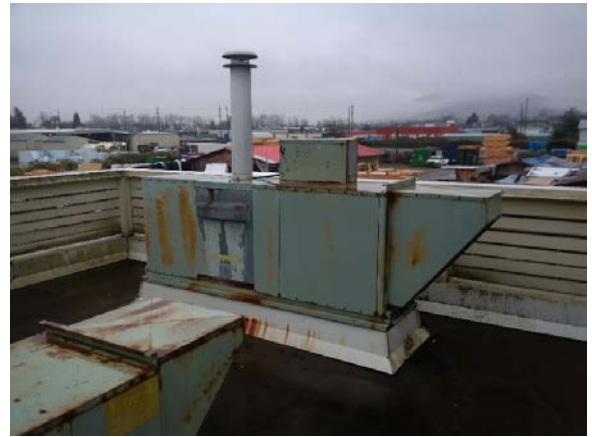
Existing MUA-1 (view 2)