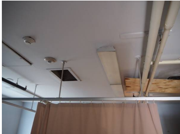
Ceiling below existing MUA-1