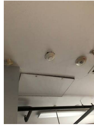
Ceiling below existing MUA-1