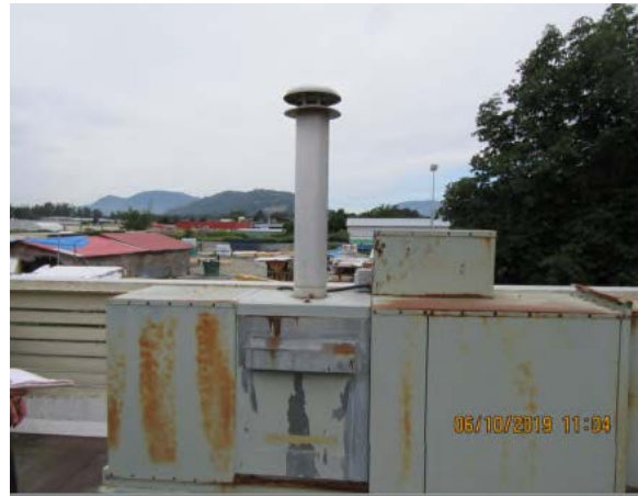
Existing MUA-1 (view 1)