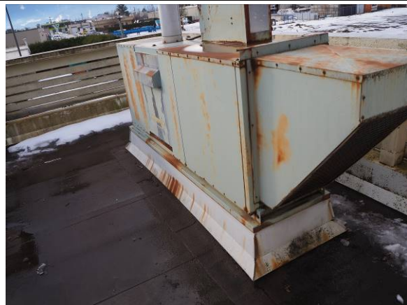
Existing MUA-1 (view 3)