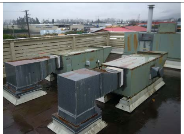
Existing F-15, F-16 (view 2)