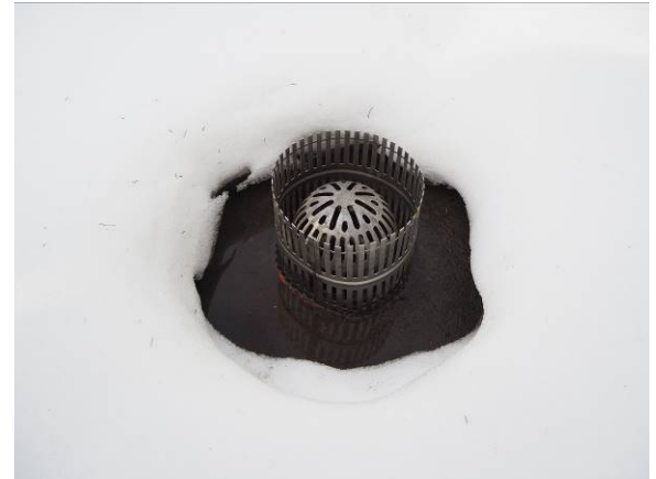
Existing Roof Drains