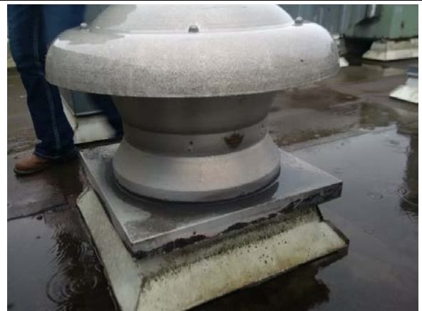
Existing Exhaust Fan