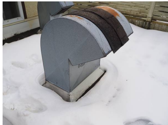
Existing Gooseneck 1