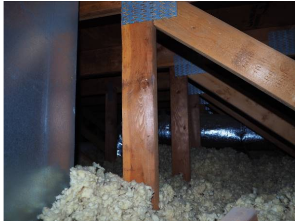
Attic below existing MUA-1