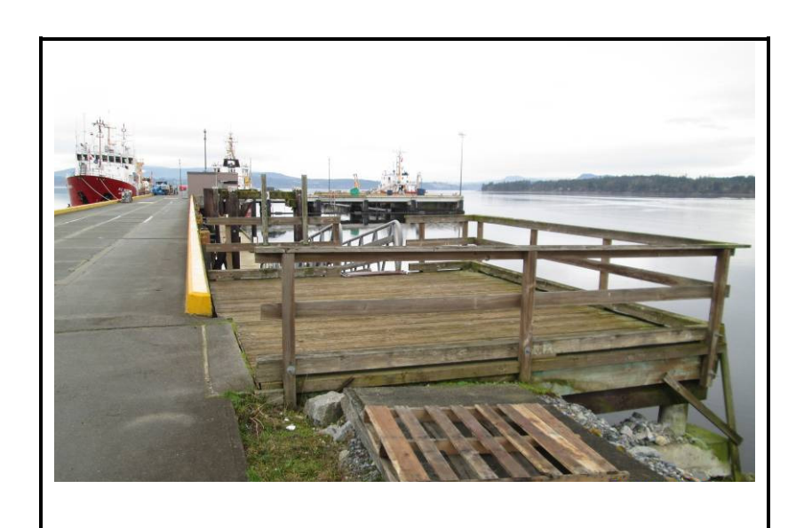
Float D Wharf