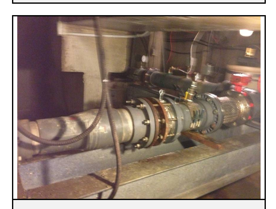
Seawater intake system (not in Scope)