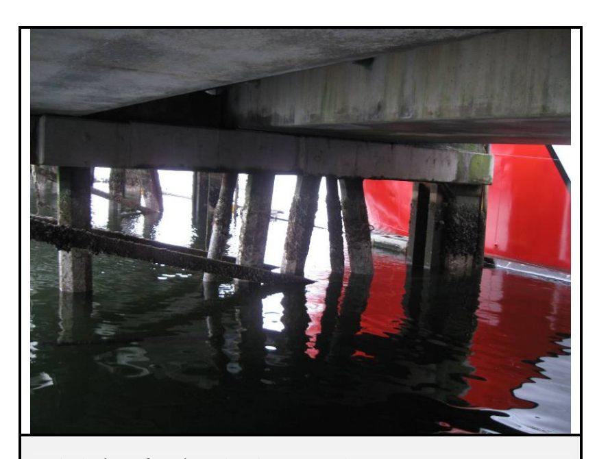
Typical View of Deck Under Pier Approach