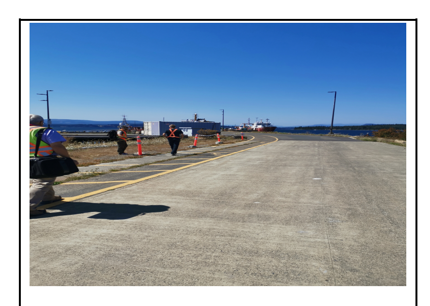
Looking West Pipe Route from valve Chamber to Fix Wharf