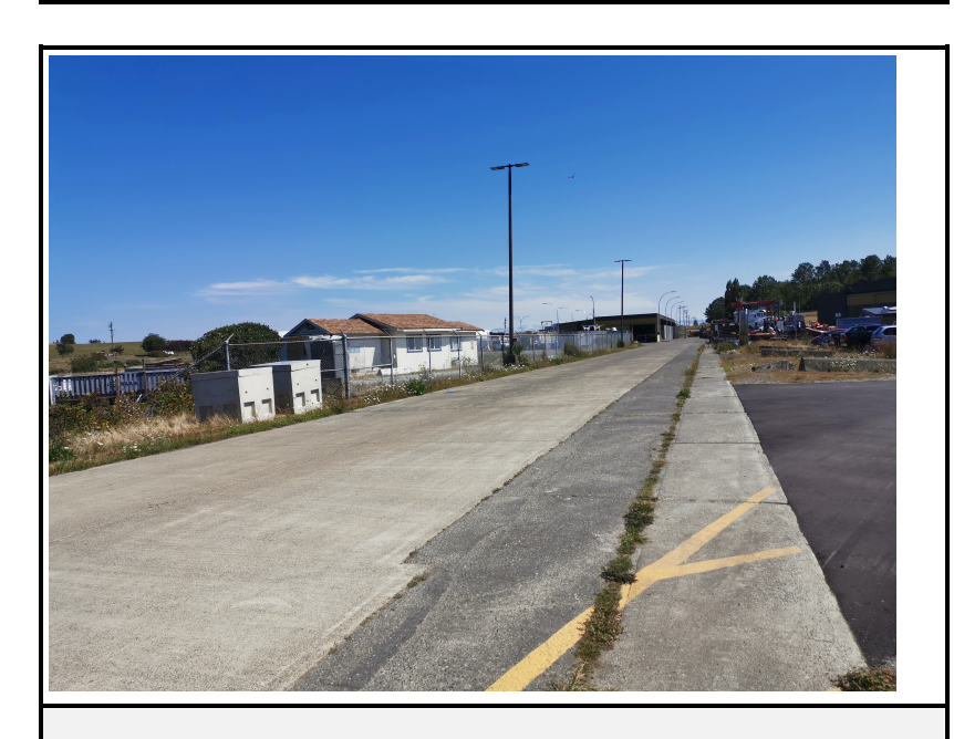
Looking East Pipe Route Between Valve Chamber & Wharf