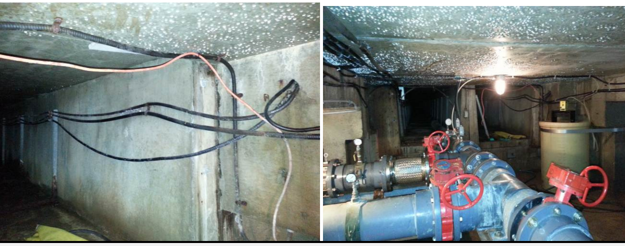
Main Wharf Saltwater Pumping Station - Not in Scope