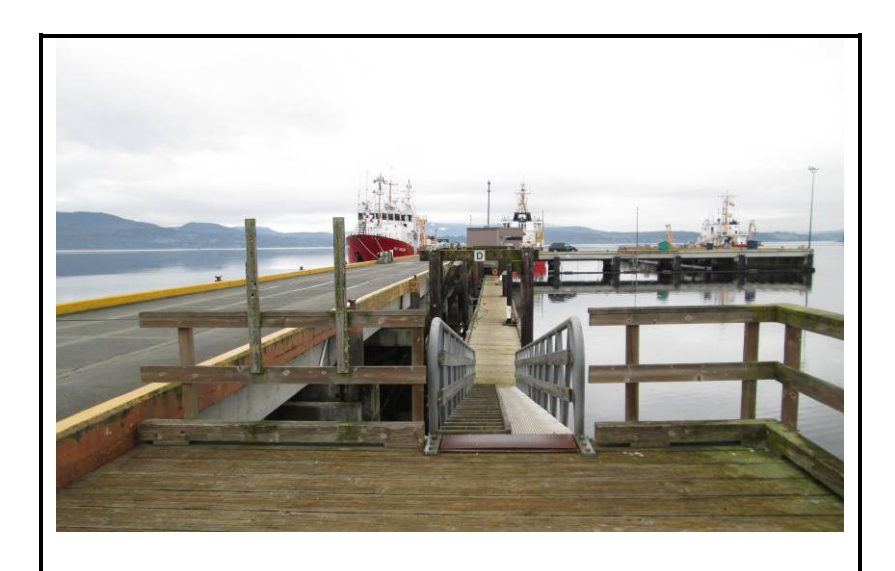
Float D From Top of Gangway