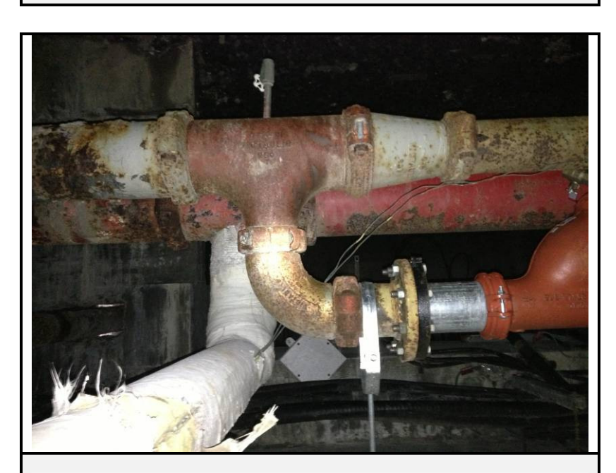
Fixed wharf water and fire line piping