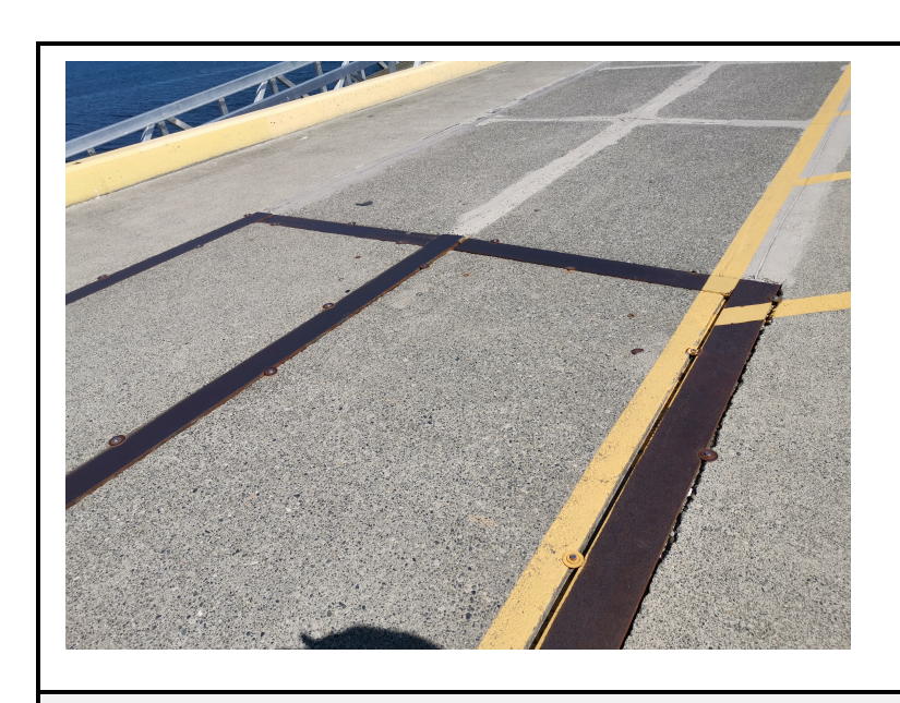
Typical View of Top of Deck