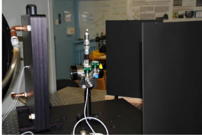
Figure 1: Laboratory test setup. On the left, the temperature-controlled aluminum plate is seen with tubes for ethylene glycol circulation and thermocouple wiring in the back. In the center, the stainless steel gas cell contains the gas sample. Ports allow for purging and filling the cell; a thermocouple measures the temperature inside. On the right, painted aluminum plates allow to hide the gas cell from the sensor.

ideal black body. The plate might be either heated or cooled using ethylene glycol circulation, providing positive or negative thermal contrast with respect to the gas sample. An infrared thermometer will be used to monitor the surface temperature of the plate independently from its control set point.