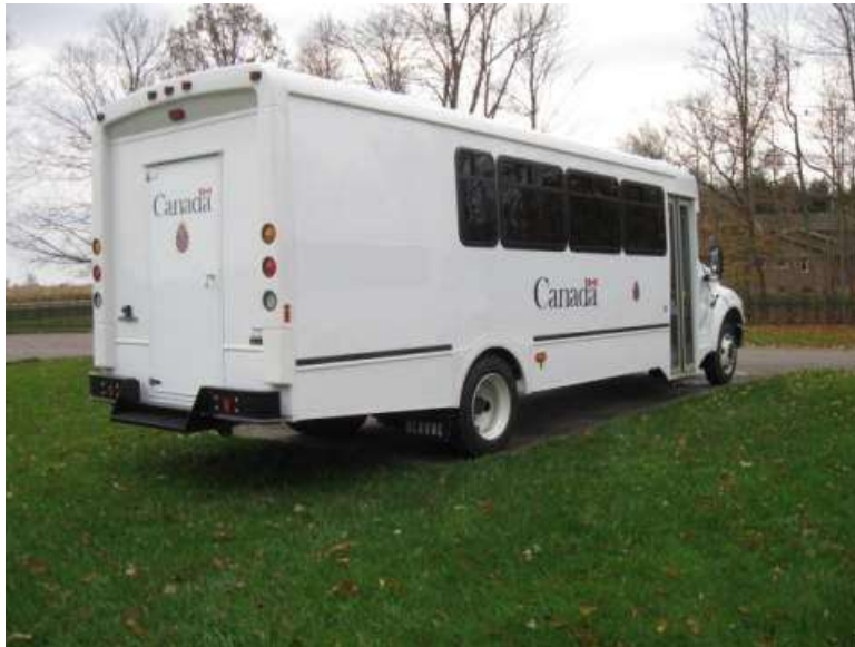
Figure 2 - Decals

This figure is only a visual representation of the decals and their position.