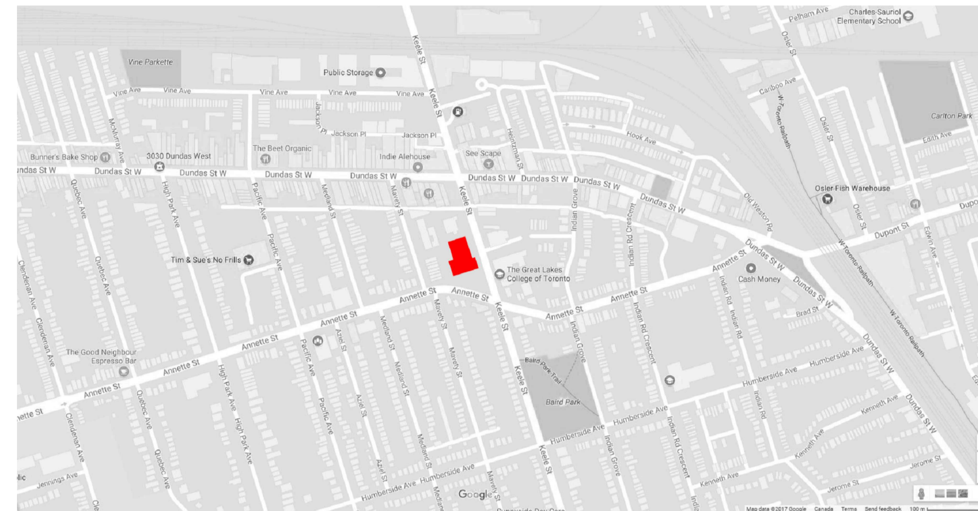
2 SITE PLAN SCALE 1:5000