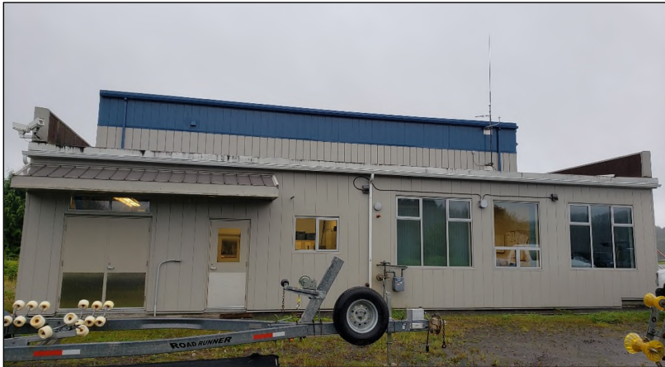
Photo: 2 Date: August 5, 2020 Description: Exterior East Elevation – Side of Building outside Workshop