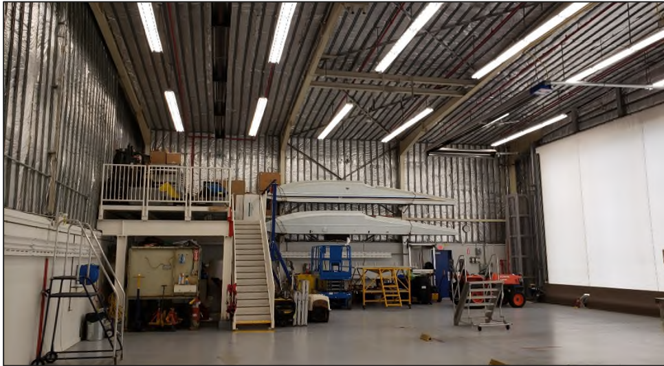
Photo: 5 Date: August 5, 2020 Description: Overview of Hangar area and Mezzanine

Services and Procurement Canada Building E0547, RCMP Hangar, #1 Coast Guard Road, Seal Cover/Prince Rupert, BC