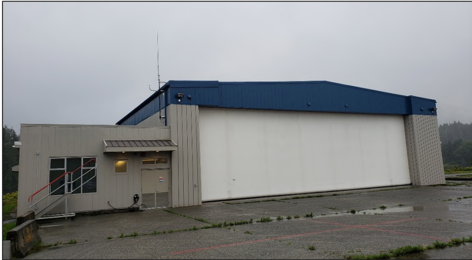
Photo: 1 Date: August 5, 2020 Description: Exterior East Elevation - Front of Building

Services and Procurement Canada Building E0547, RCMP Hangar, #1 Coast Guard Road, Seal Cover/Prince Rupert, BC