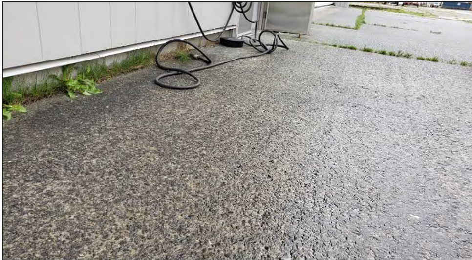
Photo: 6 Date: August 5, 2020 Description: Overview of asphalt pavement. No asbestos detected in samples collected (sample S-03A, B, C)