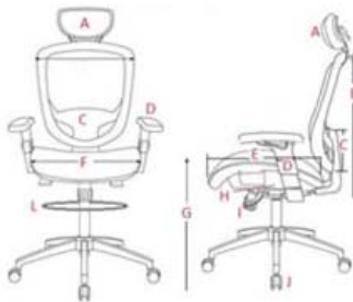
Table A2: CA2 – Rotary Conference Chair