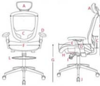
Table A1: CA1 – Rotary Task Chair