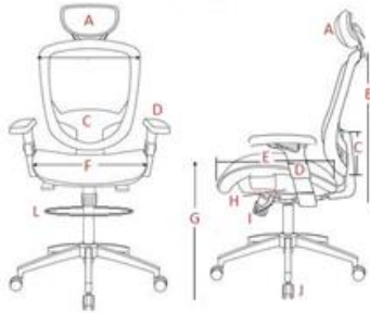
Table A5: Rotary chair E