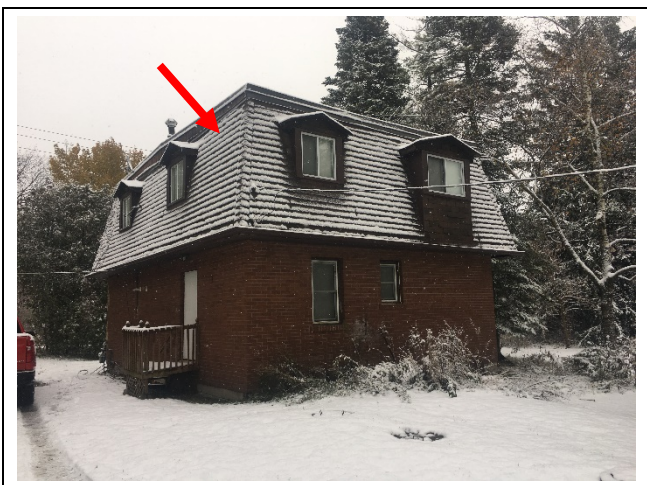
Photo 11: Presumed asbestos-containing roofing materials and roof caulking.