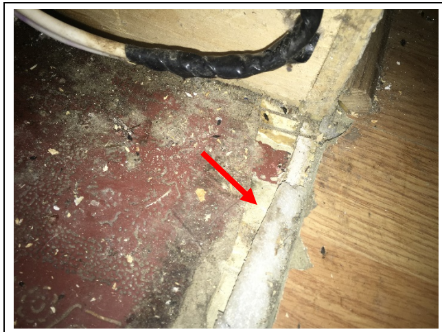
Photo 2: Damaged asbestos-containing paper-backing associated with vinyl sheet flooring – white found beneath laminate flooring in first floor kitchen.