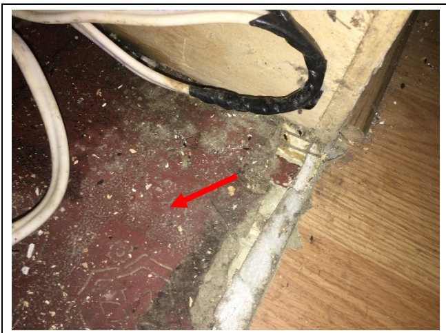
Photo 7: Asbestos-containing 12"x12" vinyl floor tile – red found beneath laminate flooring in first floor kitchen.