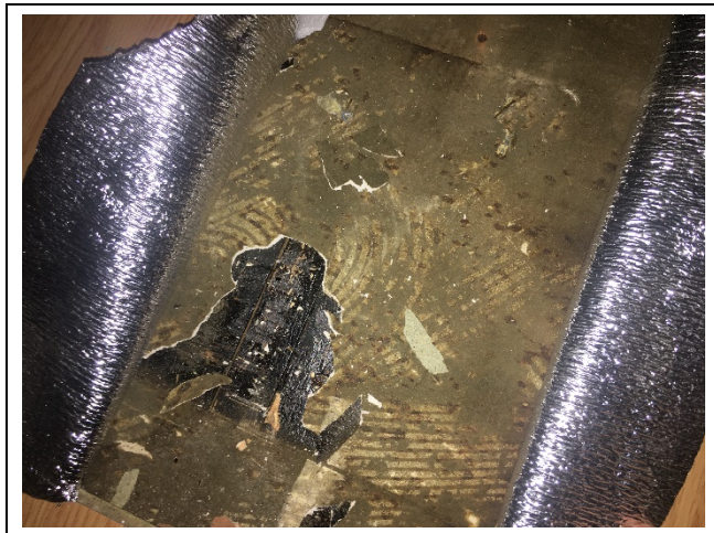
Photo 6: Asbestos-containing 12"x12" vinyl floor tile – beige found beneath laminate flooring in first floor living room.