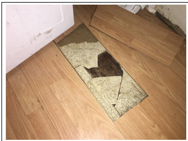
Photo 12: Presumed asbestos-containing mastic associated with 12"x12" vinyl floor tile – beige pattern beneath laminate flooring in first floor laundry room.