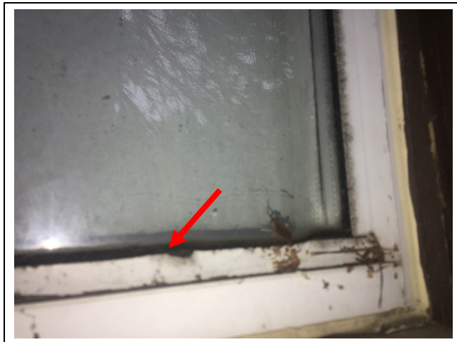
Photo 10: Asbestos-containing exterior window glazing compound – grey.