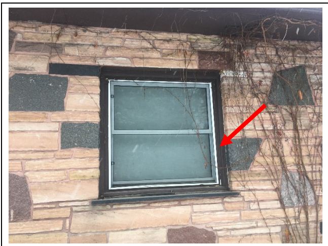
Photo 13: Damaged lead-containing brown coloured paint on exterior window frames.