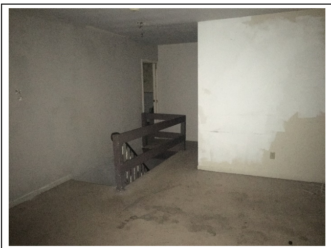
Photo 15: Lead-containing white coloured paint on second floor hallway drywall walls.