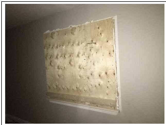
Photo 14: Lead-containing grey coloured paint on first floor living room drywall walls.