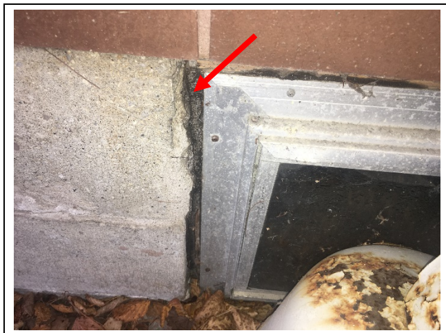
Photo 8: Asbestos-containing exterior window caulking – white (crawlspace windows only).