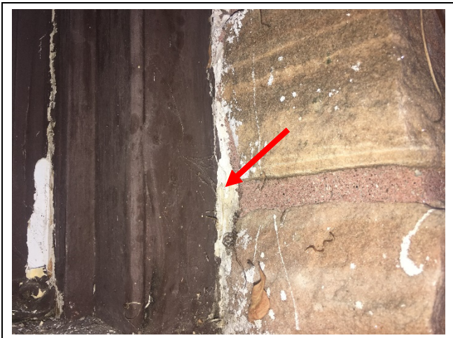
Photo 9: Asbestos-containing exterior window caulking – white (between frame and wall).