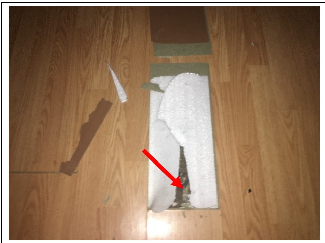
Photo 5: Asbestos-containing 12"x12" vinyl floor tile – beige pattern found beneath laminate flooring in first floor laundry room.