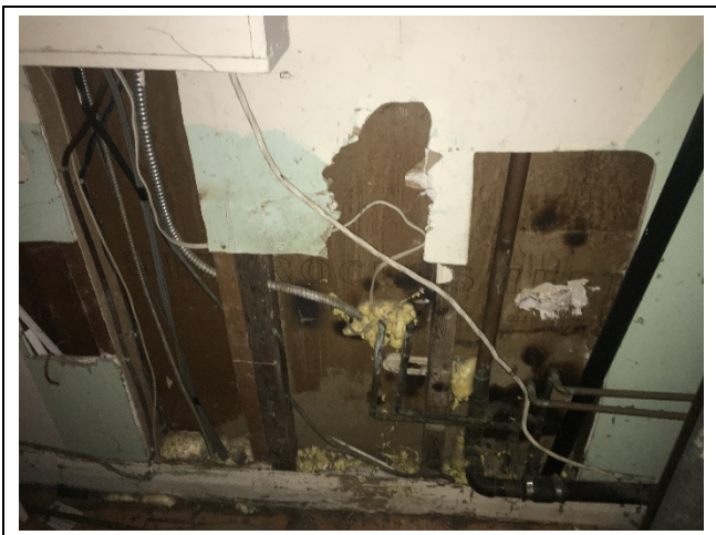
Photo 3: Damaged asbestos-containing drywall joint-fill compound in first floor laundry room.