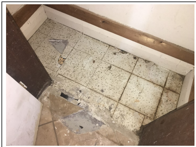
Photo 4: Asbestos-containing 9"x9" vinyl floor tile – white with green flecks in first floor foyer closet.