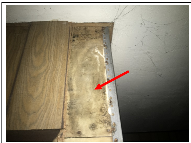
Photo 16: Suspect mould observed on wood framing beneath wood panel wall in second floor bedroom 3.