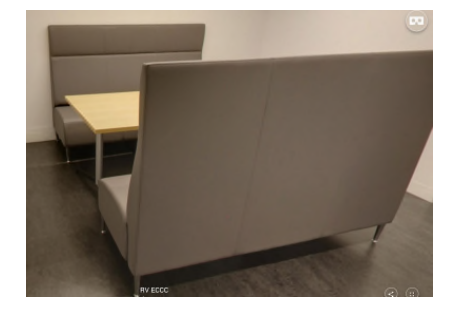
#5 - Folding table on wheels 30x60

The height of the tables should be 29 inches. The surface must be foldable. Dimensions should be 30 by 60 inches.