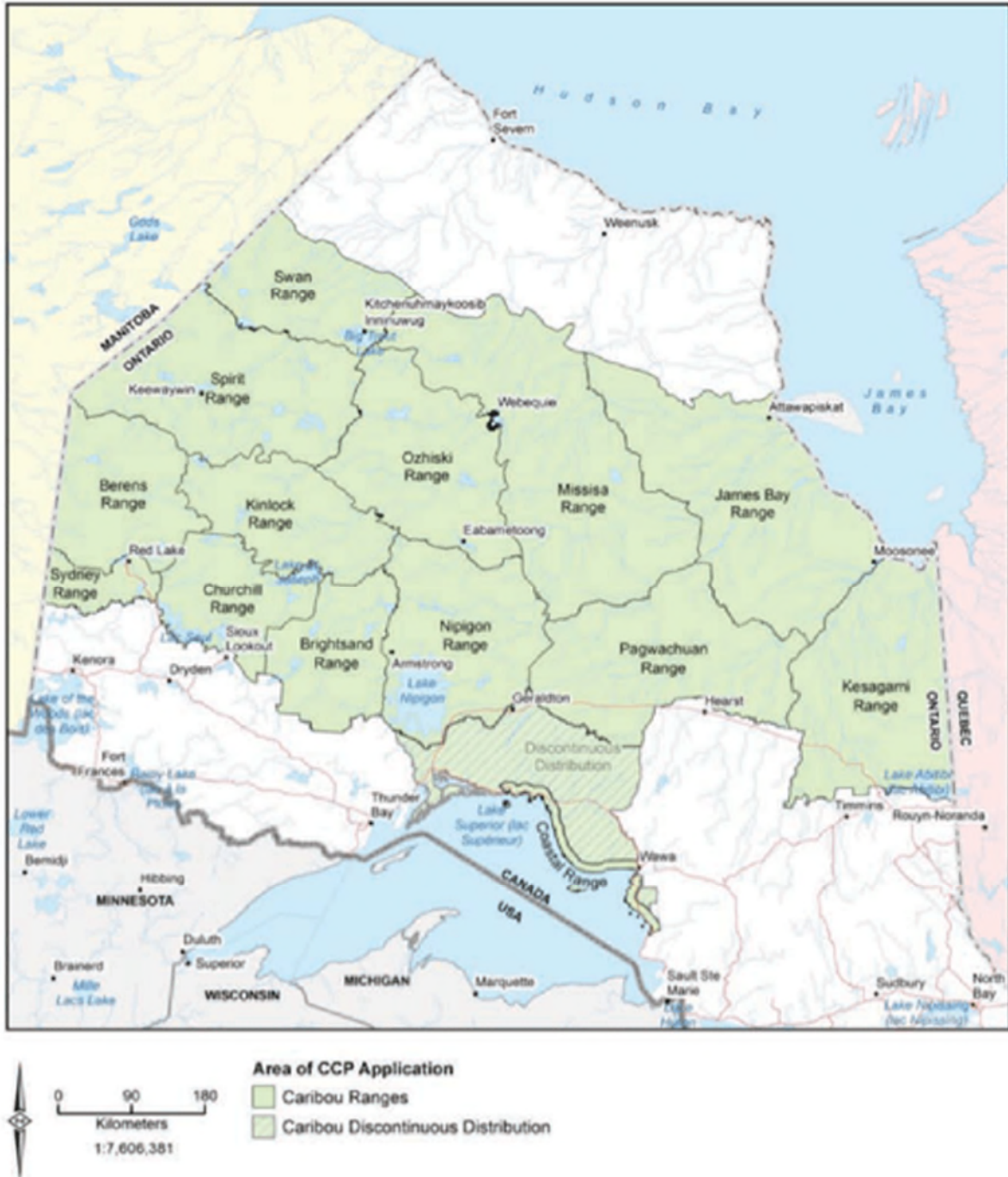
Figure 1 In 2014, the province of Ontario identified six Ranges to replace the federal Far North (ON9) range. The boundary of the provincial Ozhiski Range is the proposed study area for this project. [Figure from Ministry of Natural Resources & Forestry (MNRF), 2014. State of the Woodland Caribou Resource Report. Species at Risk Branch, Thunder Bay, Ontario. + 156 pp. ]