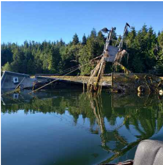
Figure 1. Vessel port side at low tide.

The CCG has a requirement to remove a 70' ex-fishing vessel that has partially sunk in Rance Inlet, Bamfield, at position: 48° 49.17N, 125° 08.20W. The vessel is currently posing a hazard to an environmentally and culturally sensitive area. CCG Environmental Response personnel have assessed the vessel and found no measurable hydrocarbons on board.