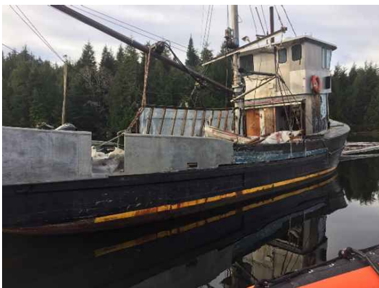
Figure 3. Vessel in 2018 before sinking.