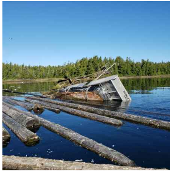
Figure 2. Vessel stern at high tide.