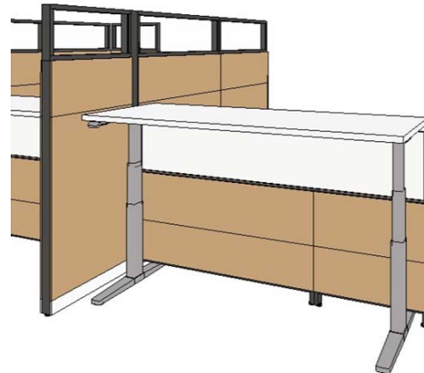
Standing Employee Typical 1