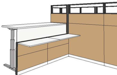
Standing Accessible Typical 2