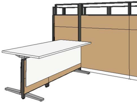
Seated Client Typical 1