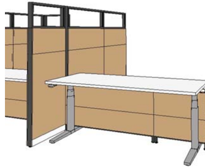
Seated Employee Typical 1