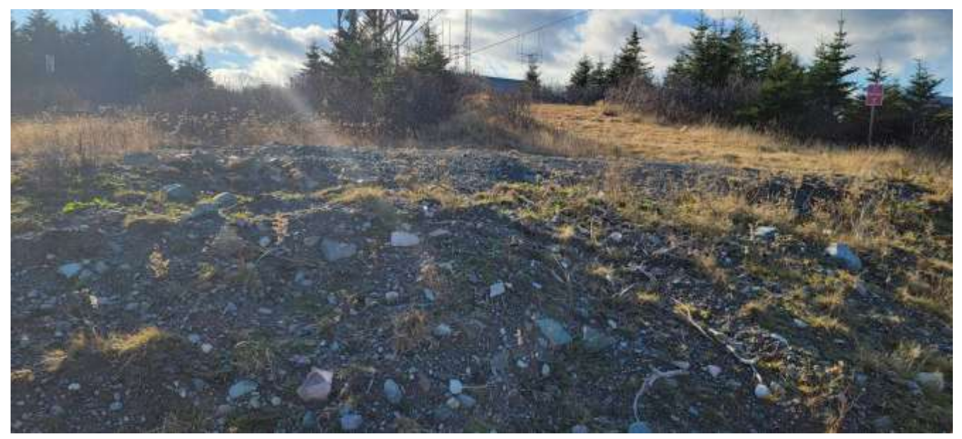
Photo 3: Buried 4800V (encased in concrete) see raised berm center