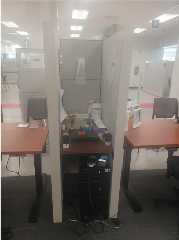
Photo of the “U” and the shelf to be fixed between the panels in Mont-Laurier