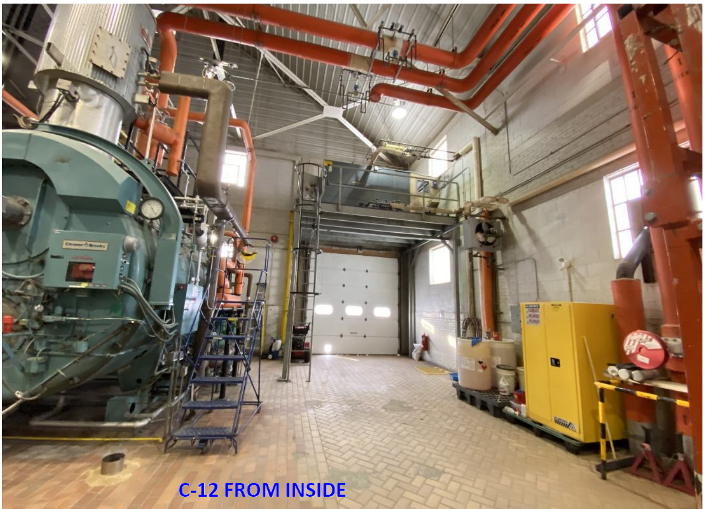
C-12 FROM INSIDE