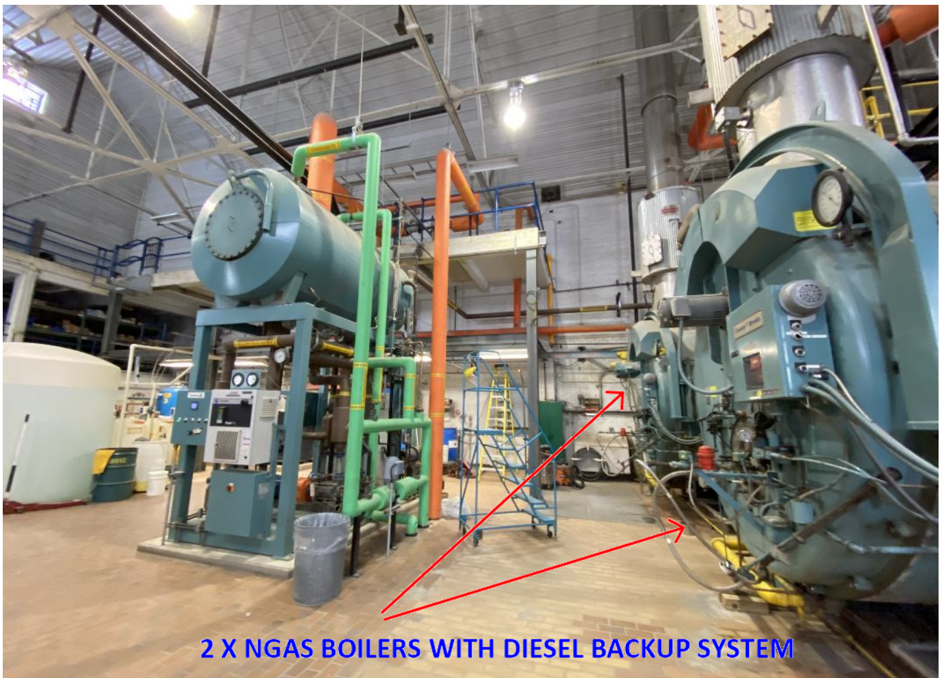
2 X NGAS BOILERS WITH DIESEL BACKUP SYSTEM