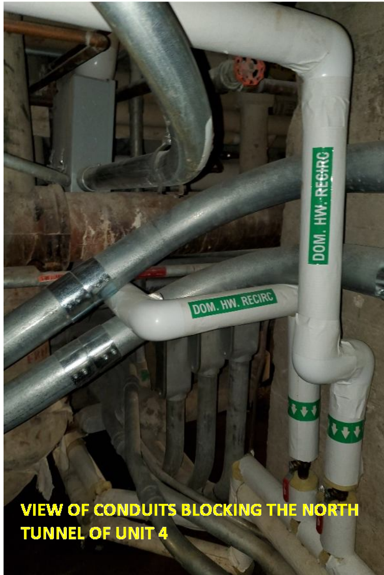
VIEW OF CONDUITS BLOCKING THE NORTH TUNNEL OF UNIT 4