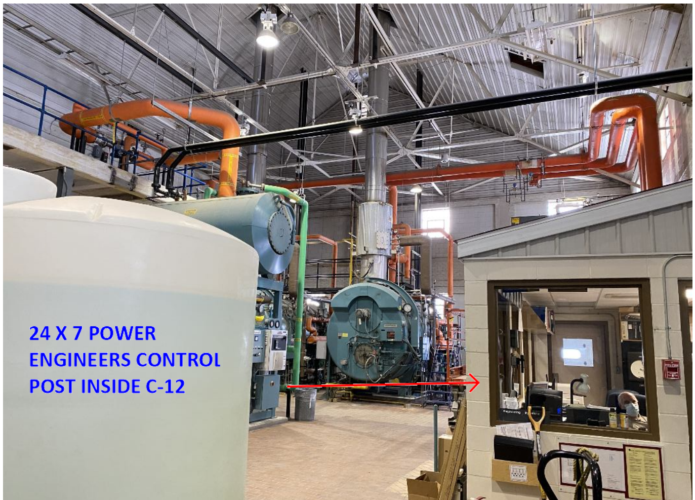
24 X 7 POWER ENGINEERS CONTROL POST INSIDE C-12