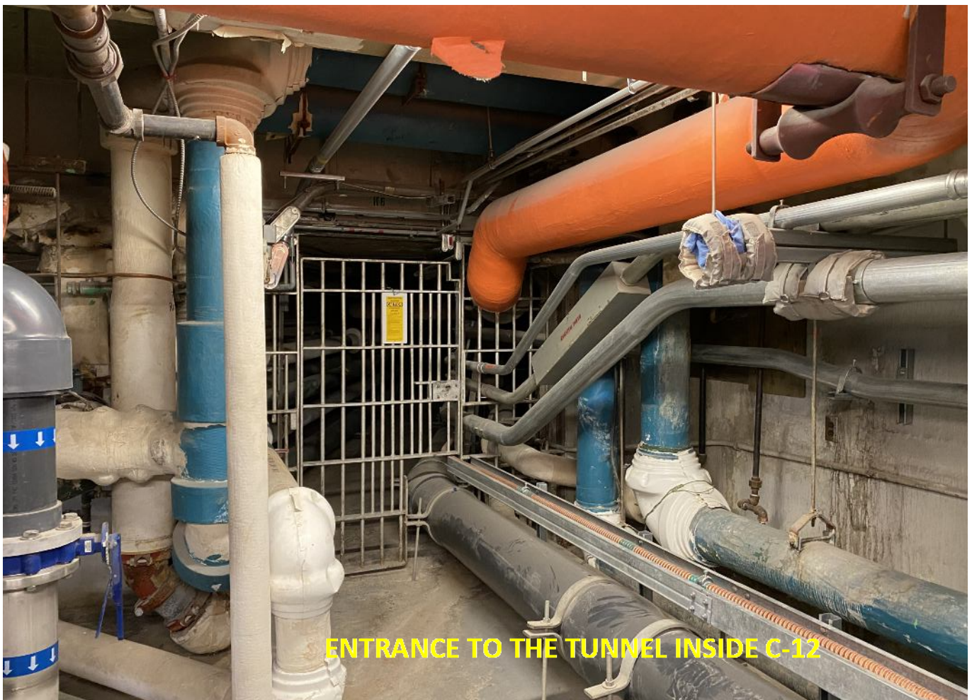
ENTRANCE TO THE TUNNEL INSIDE C-12