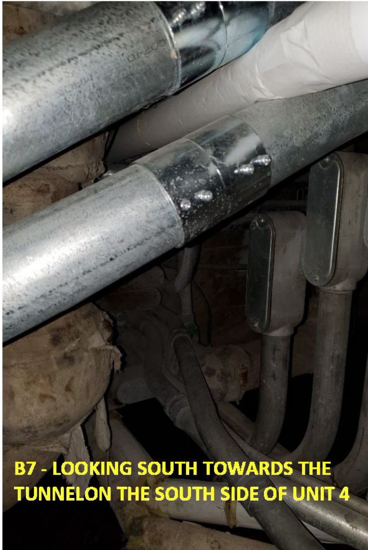
B7 - LOOKING SOUTH TOWARDS THE TUNNEL ON THE SOUTH SIDE OF UNIT 4