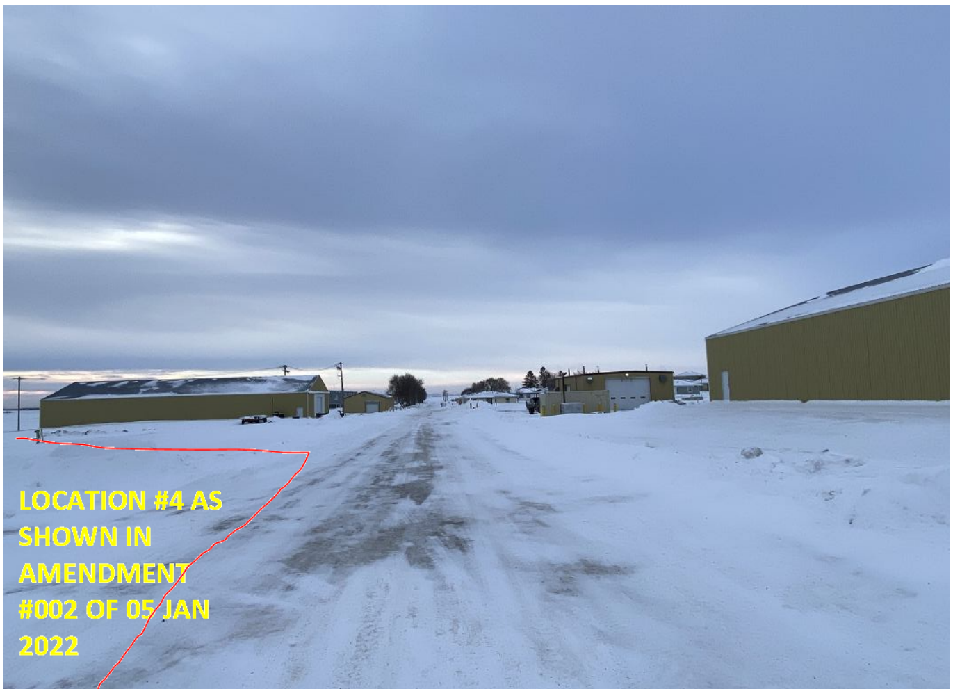
LOCATION #4 AS SHOWN IN AMENDMENT #002 OF 05 JAN 2022