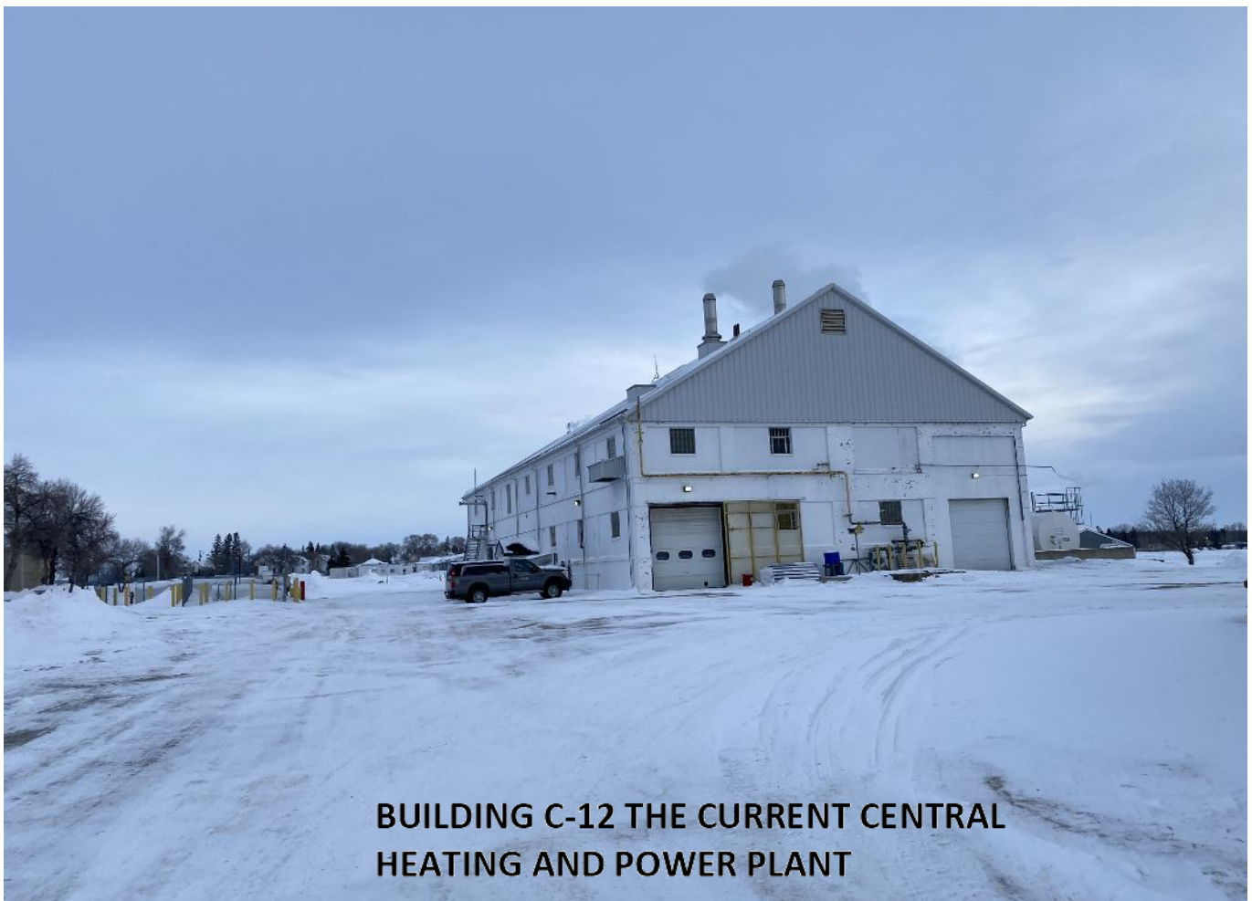
BUILDING C-12 THE CURRENT CENTRAL HEATING AND POWER PLANT