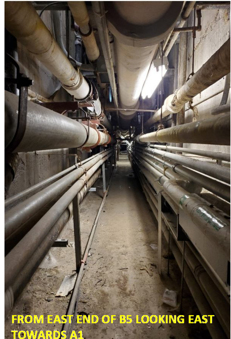
FROM EAST END OF B5 LOOKING EAST TOWARDS A1