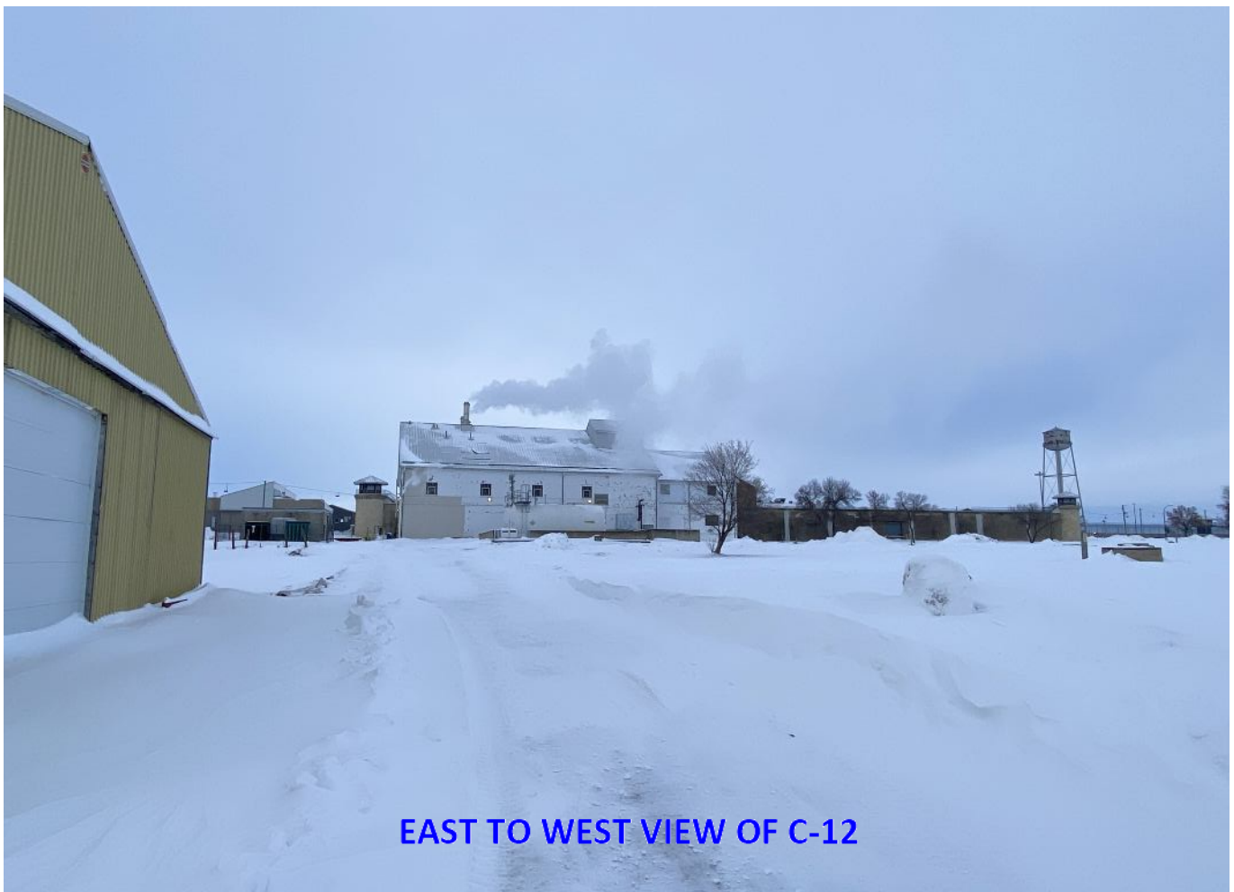
EAST TO WEST VIEW OF C-12