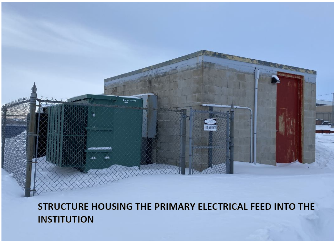
STRUCTURE HOUSING THE PRIMARY ELECTRICAL FEED INTO THE INSTITUTION