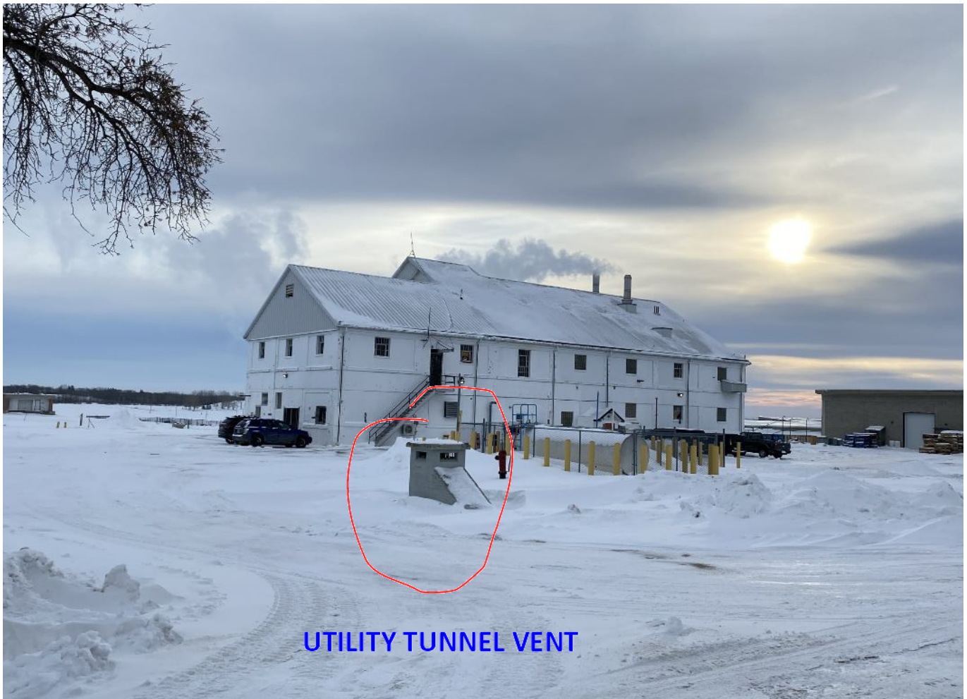
UTILITY TUNNEL VENT