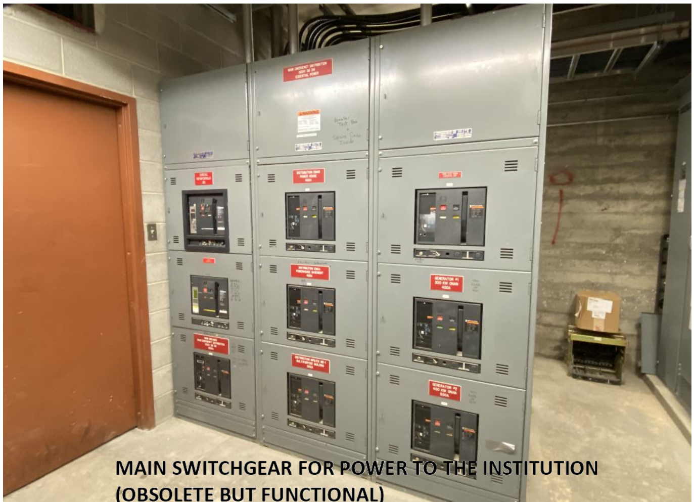
MAIN SWITCHGEAR FOR POWER TO THE INSTITUTION (OBSOLETE BUT FUNCTIONAL)