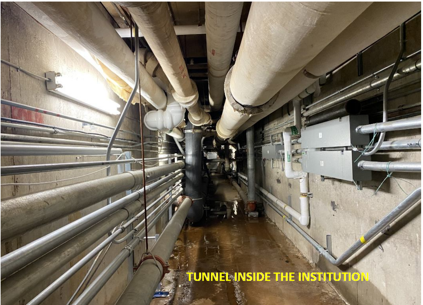
TUNNEL INSIDE THE INSTITUTION