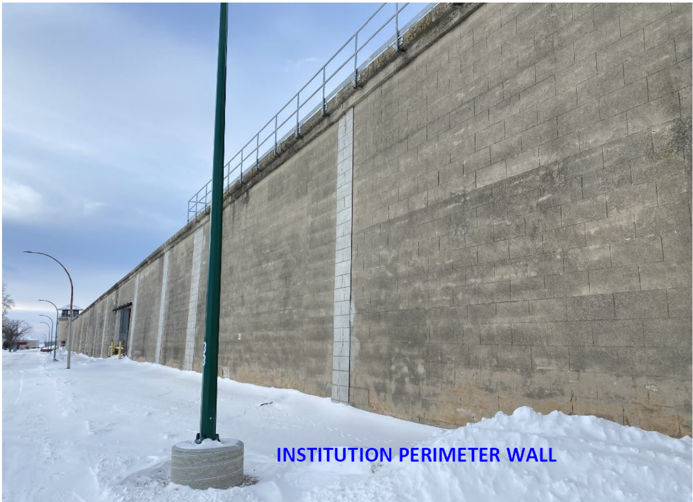
INSTITUTION PERIMETER WALL