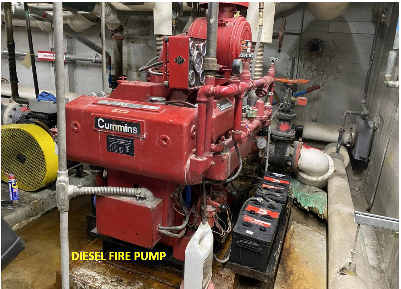
DIESEL FIRE PUMP