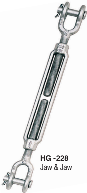
HG -228 Jaw & Jaw

Meets the performance requirements of Federal Specifications FF-791b, Type 1 Form 1 - CLASS 7, and ASTM F-1145, except for those provisions required of the contractor. For additional information, see page 452.