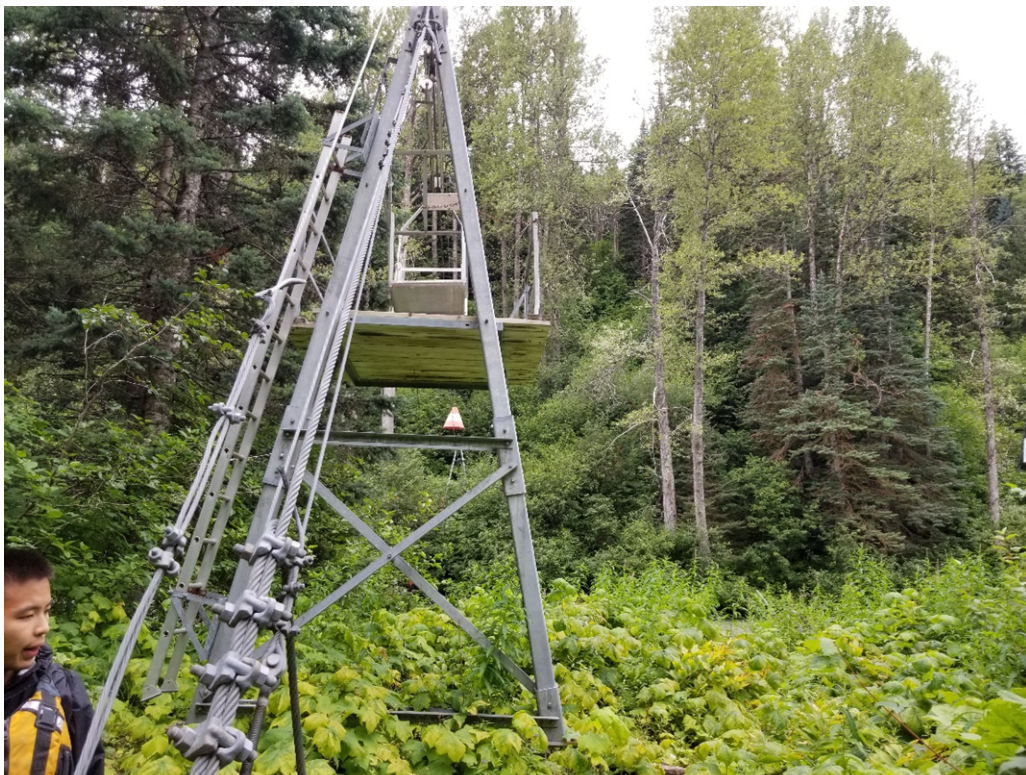
Photo 3. Home Side A-Frame and Platform