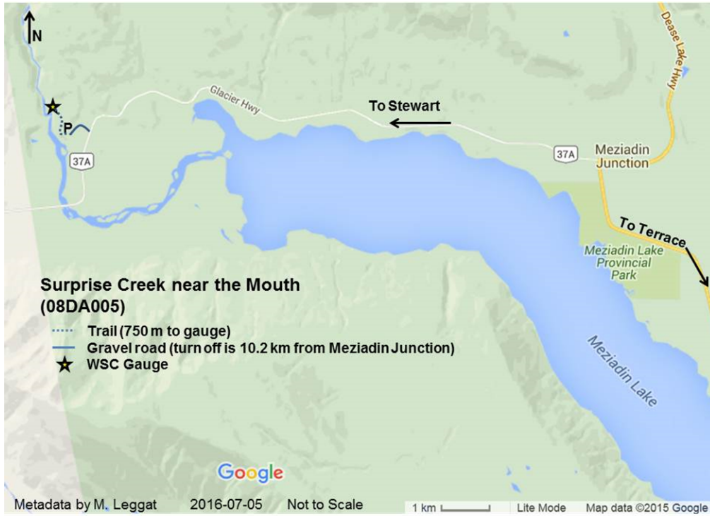
Figure 1: Station Location