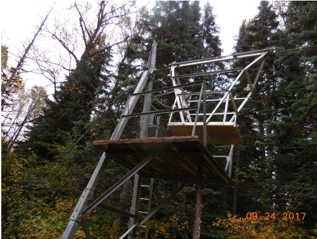
Photo 2. Existing Cable Car