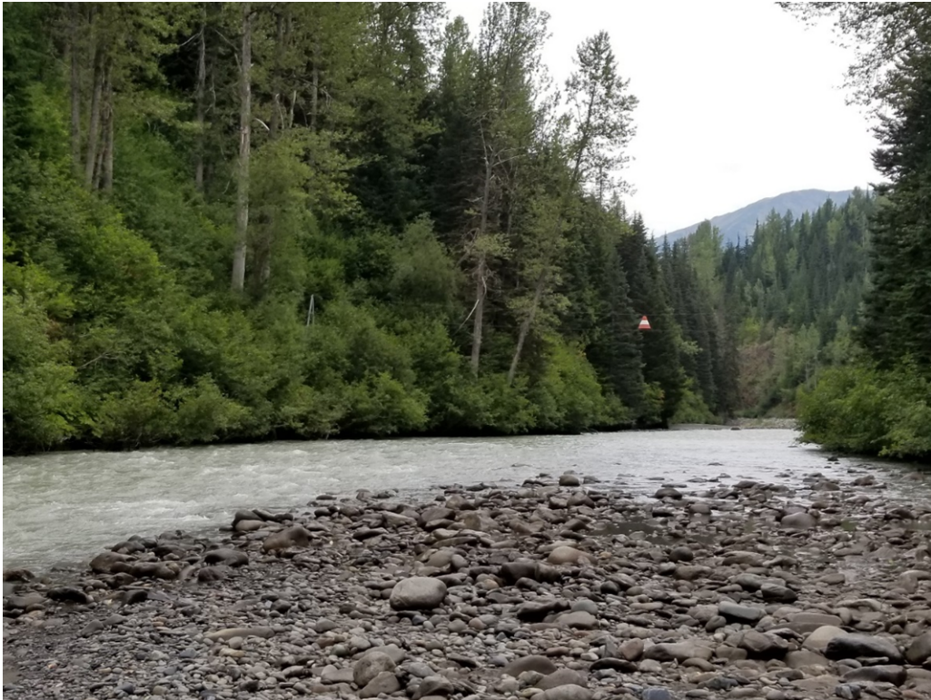
Photo 1. General View of Cableway