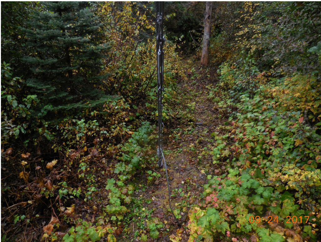
Photo 5. Far Side Anchor