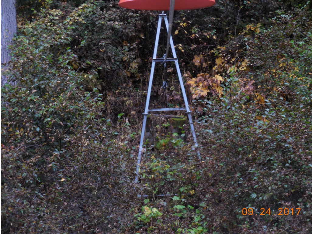
Photo 4. Far Side A-Frame and Platform