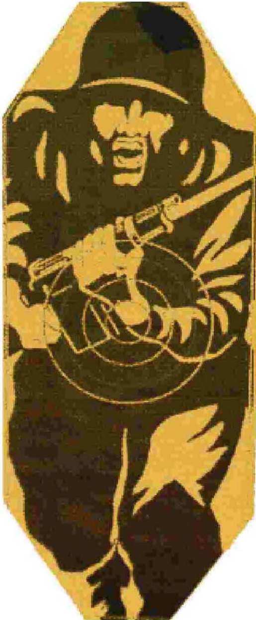
Fig11 (44ins x 16ins)