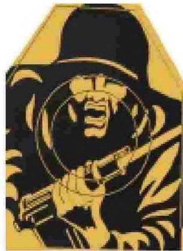
Fig12c (16ins x 12ins)