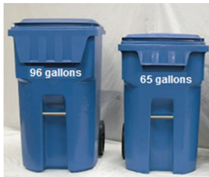
Figure 1 – Image Sample: 96 and 65 Gallon Wheeled Container with Document Chute

These containers are to be the default sizes and considered first for most CRA office locations.