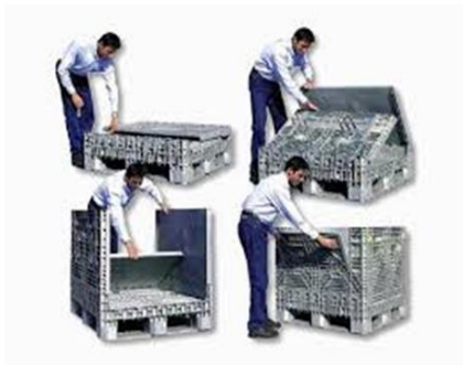
*Figure 2 – Image Sample: 200 Gallon Gaylord Container

These containers are to be the default sizes and considered first for most CRA office locations.