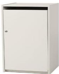
**Figure 3 – Image Sample: 32 Gallon Console Container

This high-capacity container may be required in CRA locations where volumes demand and where facilities, equipment and resources exist.