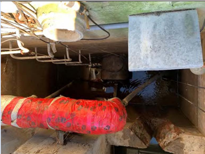
Administrative Center – No plan of the installation