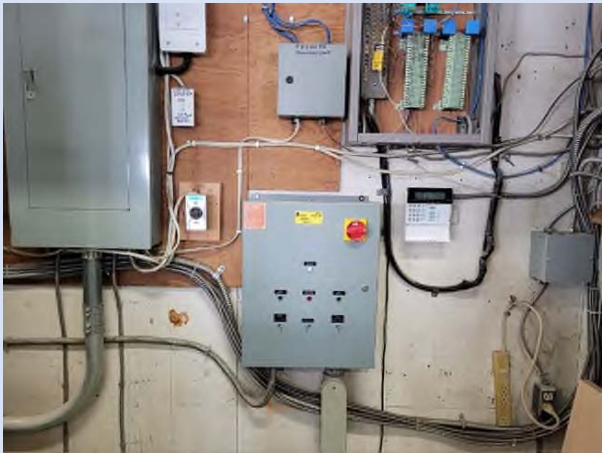
Interpretation Center – No plan of the installation