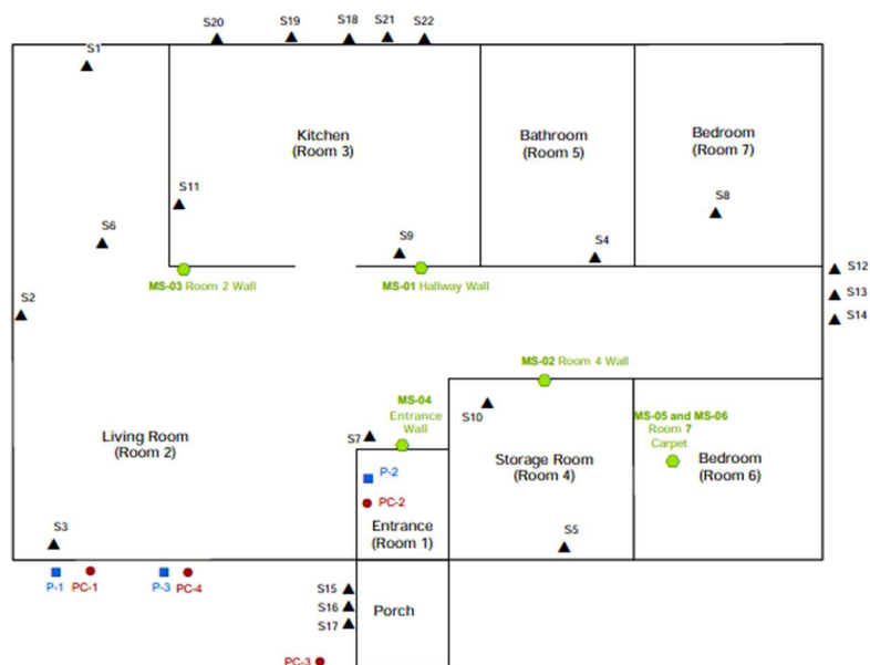
Photo 2: Building sketch and room numbers. Approximate building size is 8m x 16m (26' x 52').