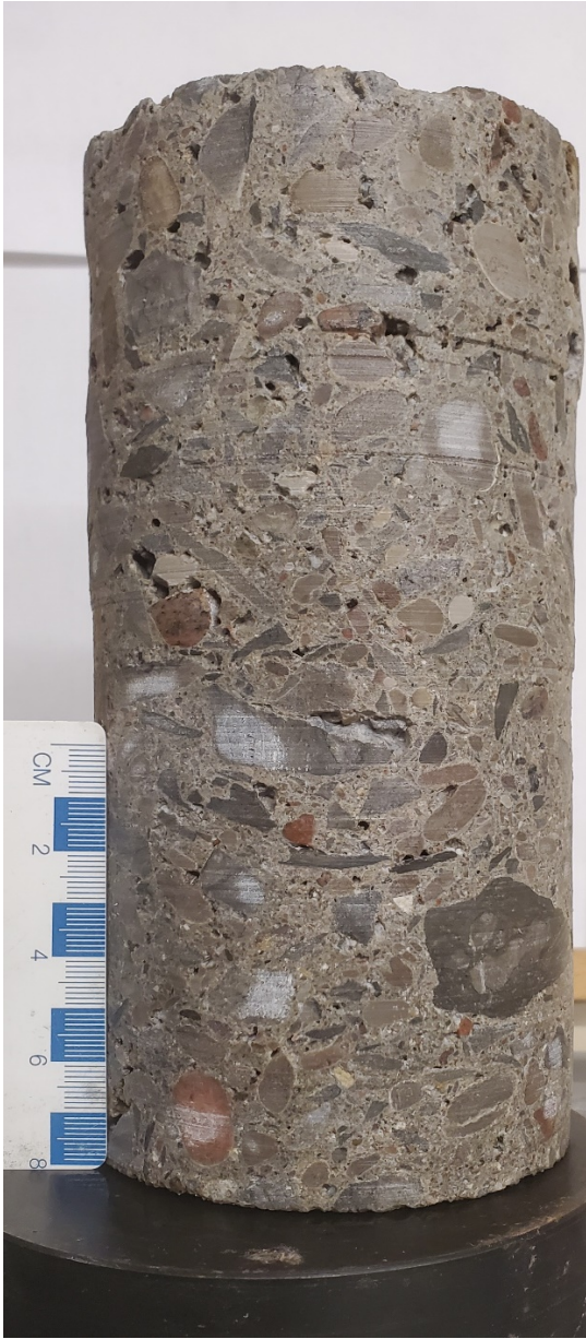
Photo 1A - Core No. 1 Pre-Compression