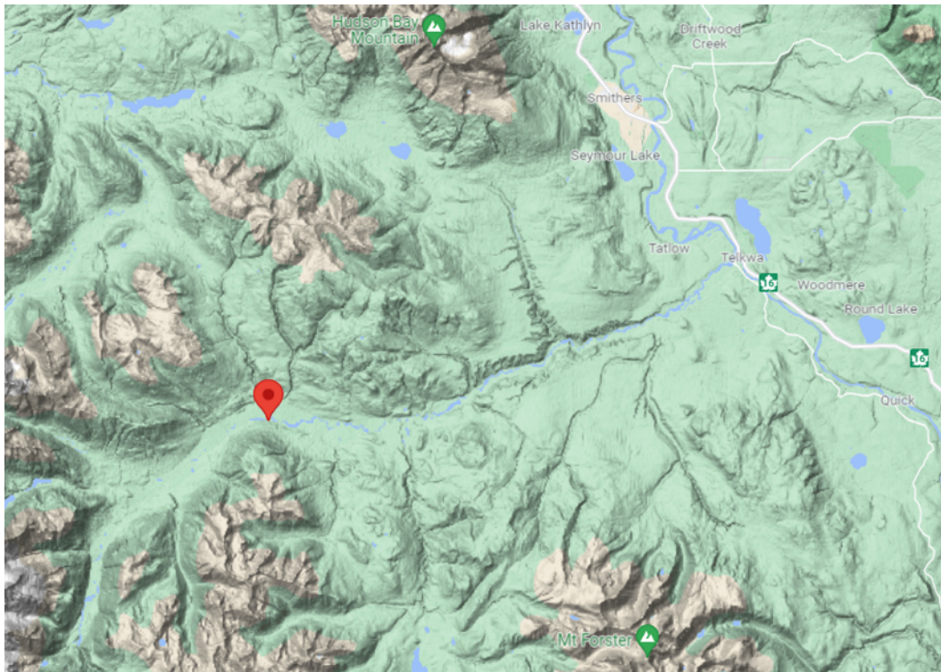
Figure 1: Station Location