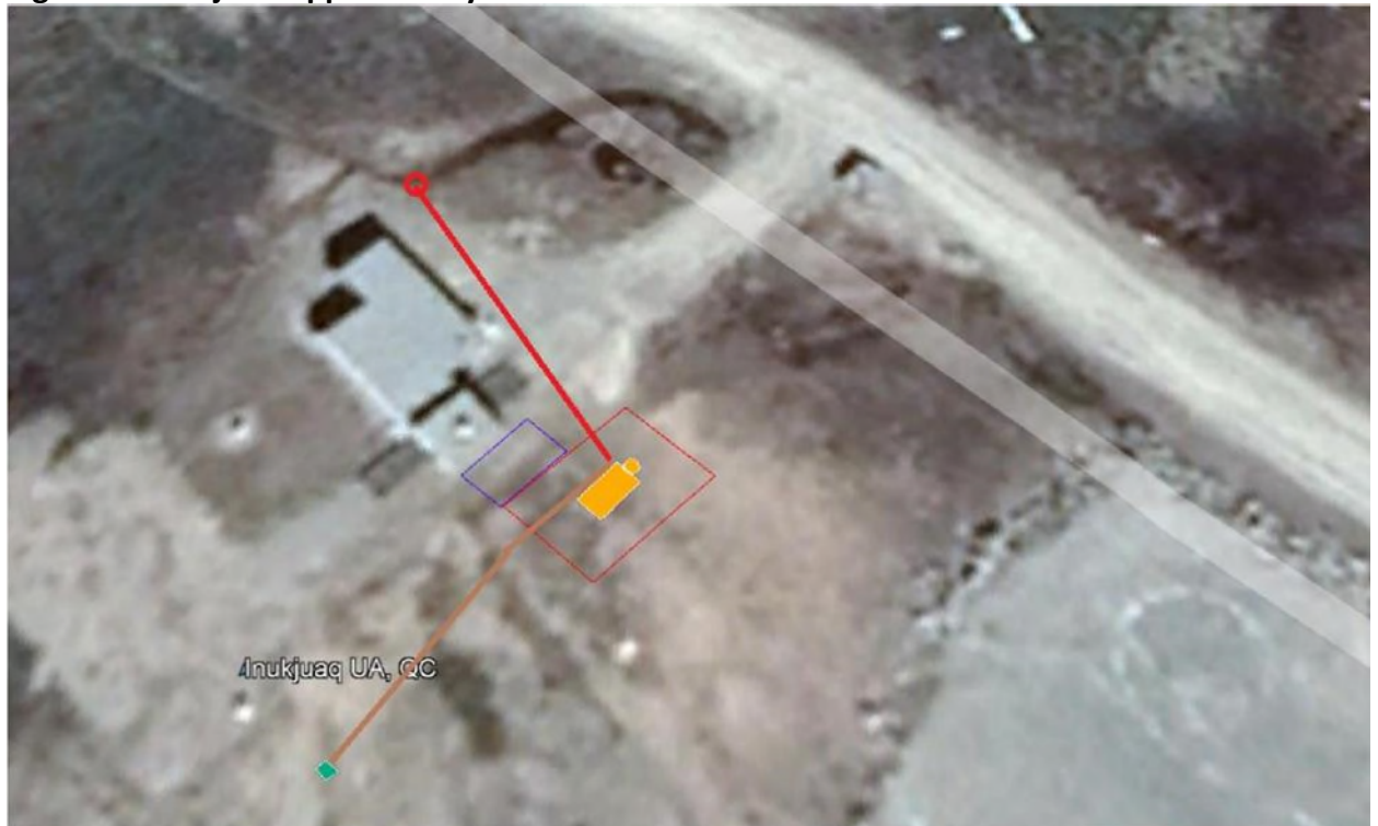
Figure 1 - Inukjuak Upper Air Layout

Red line– Existing Power Pole and proposed Electrical service trench (133m)