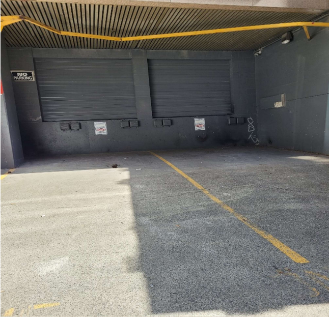
Picture of loading area