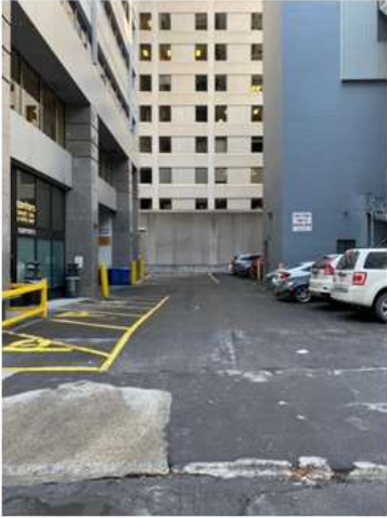
Picture 1: Picture from street of side of 255 Albert where loading dock is located.