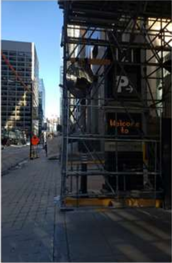
Picture 1: Picture from street of side of 121 King Street West where loading dock is located.