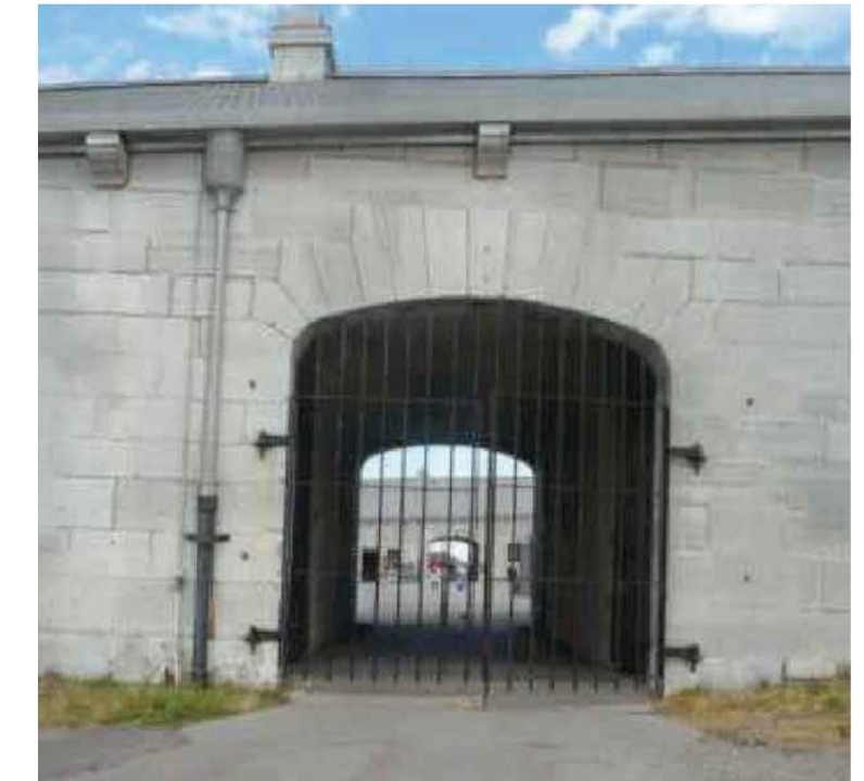
EAST ENTRANCE NTS