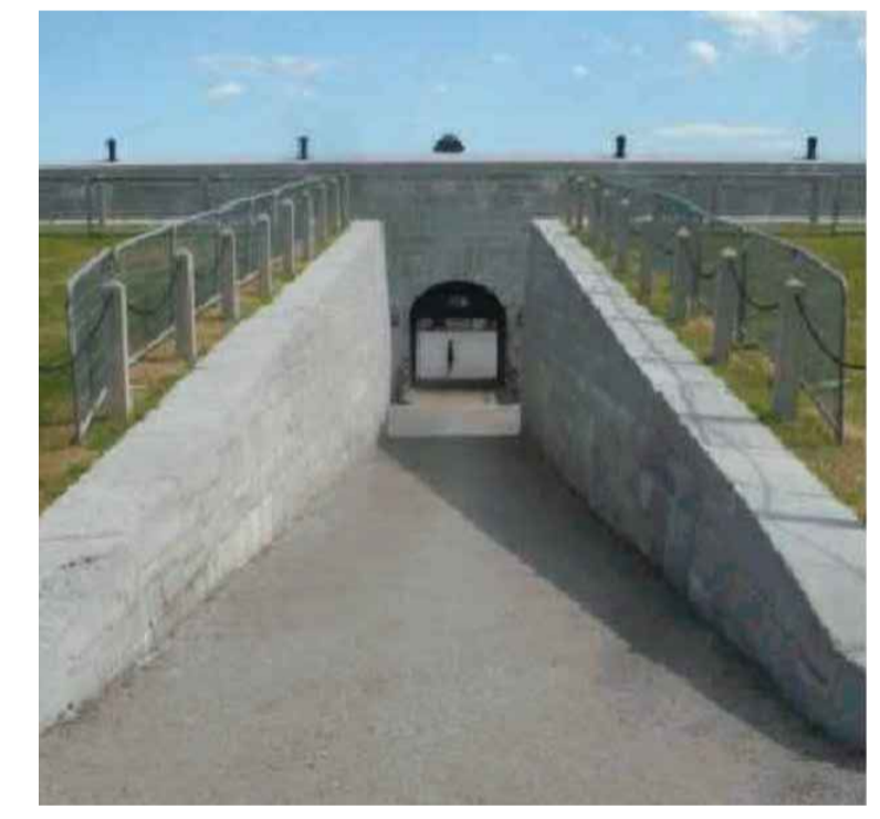
ENTRANCE CUT NTS