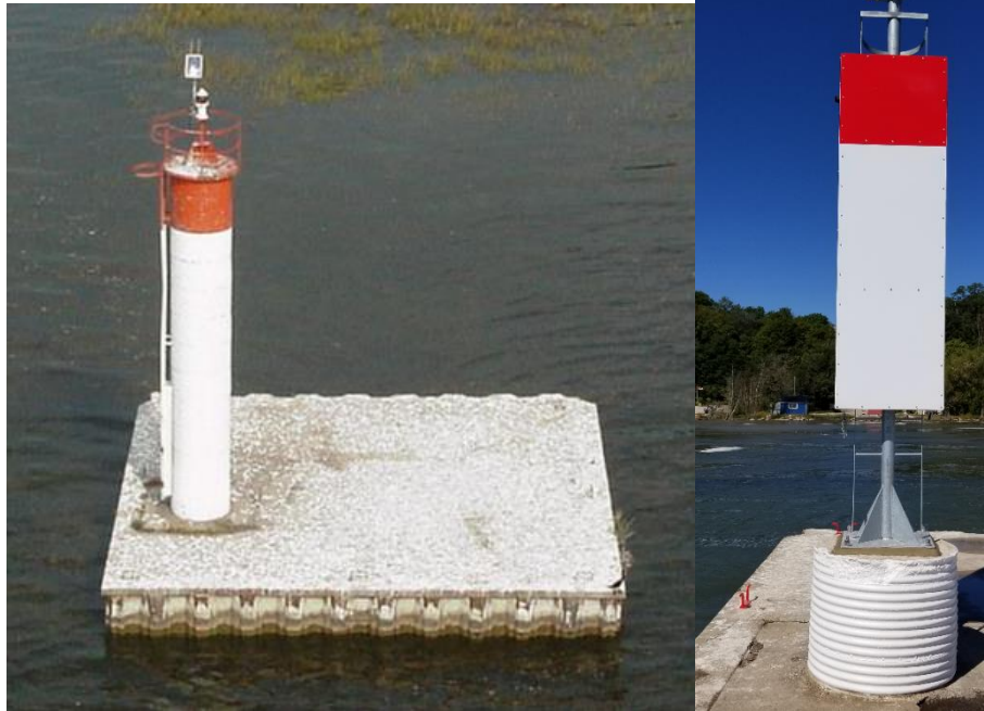
Figure 4: LL574 St. Williams