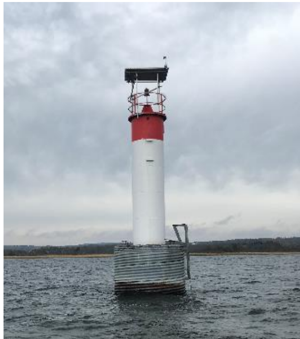
Figure 3: LL486 Brighton 3