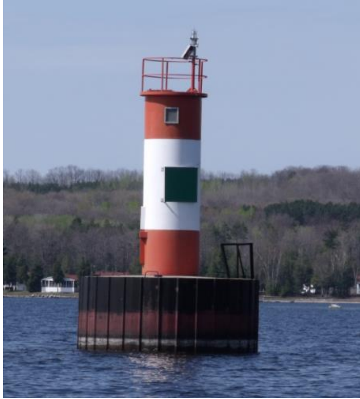
Figure 8: LL874 Asylum Point