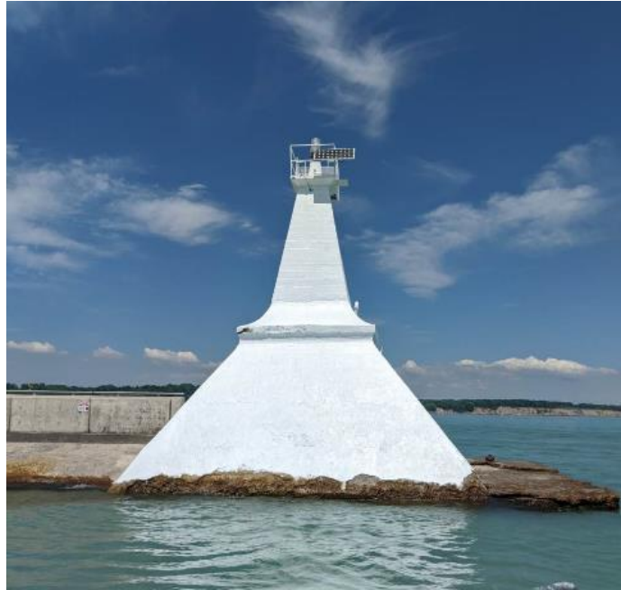
Figure 6: LL588 Port Stanley Breakwater