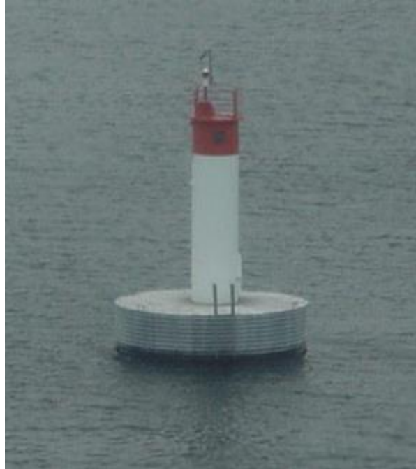
Figure 2: LL472 Narrows Shoal