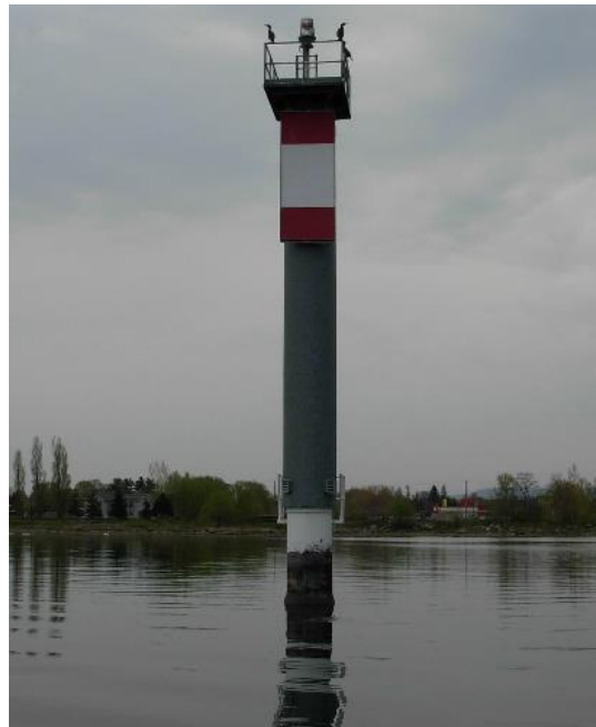
Figure 7: LL853 Collingwood Sector