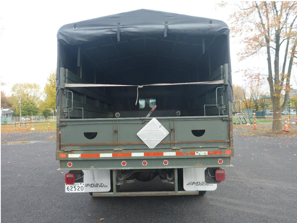
Figure 2- Rear View of Vehicle with Safety Strap