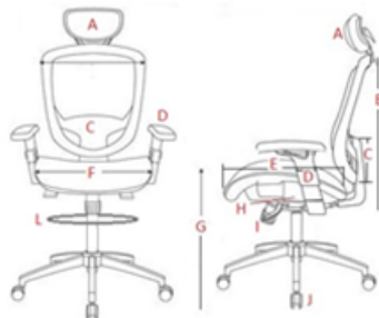
Table A2: Conference Room Rotary Chair