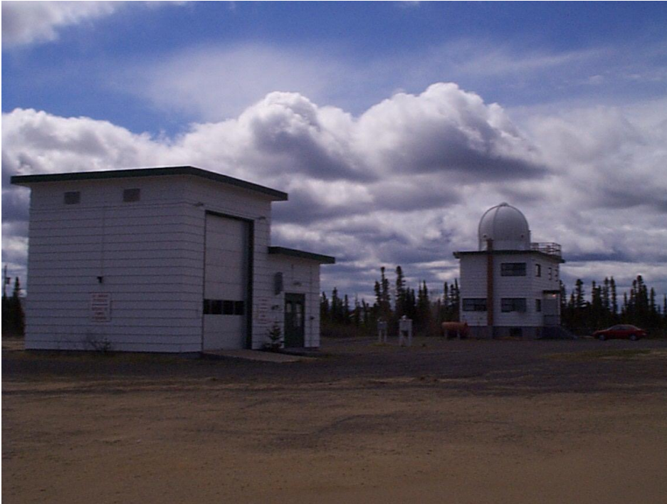
The Upper Air Weather Station – Operations Building (right) and the Hydrogen shed (left) where the balloon releases occur.