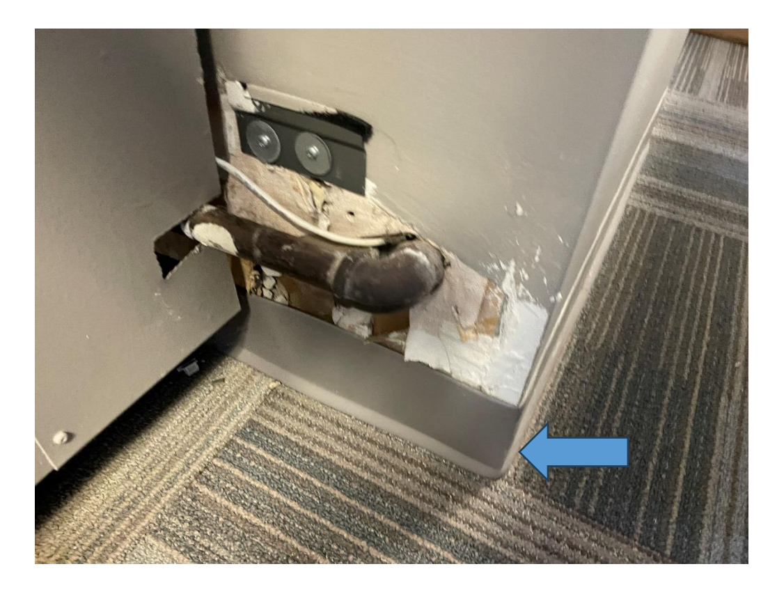
Figure 6: Representative photograph of non-asbestos containing vinyl baseboard/mastic observed throughout the project areas (Sample ID: AS-07A-C). Gray wall paint was also sampled from this location and is confirmed to be non-lead containing (Sample ID: LP-01, 8ppm).