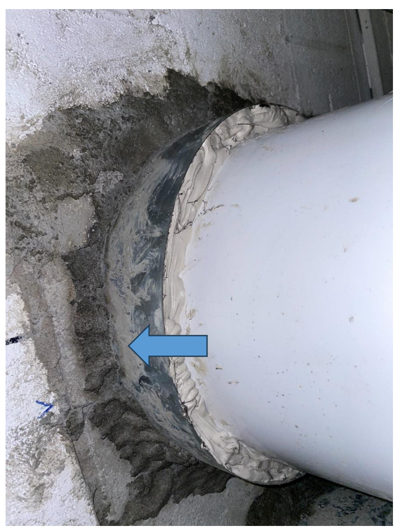
Figure 1: Representative photograph of non-asbestos containing cement parging at pipe penetrations within the Ground Floor Mechanical Room (Room 1457). Cement parging is confirmed to be non-asbestos containing (Sample ID: AS-01A-C)