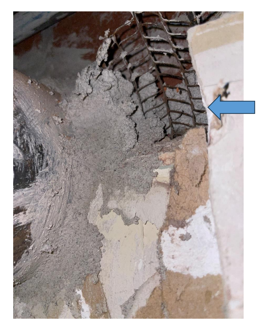
Figure 3: Representative photograph of wall plaster (white and gray layers) observed behind drywall throughout the project areas. Drywall joint compound is confirmed to be non-asbestos (Sample ID: AS-03A-D).