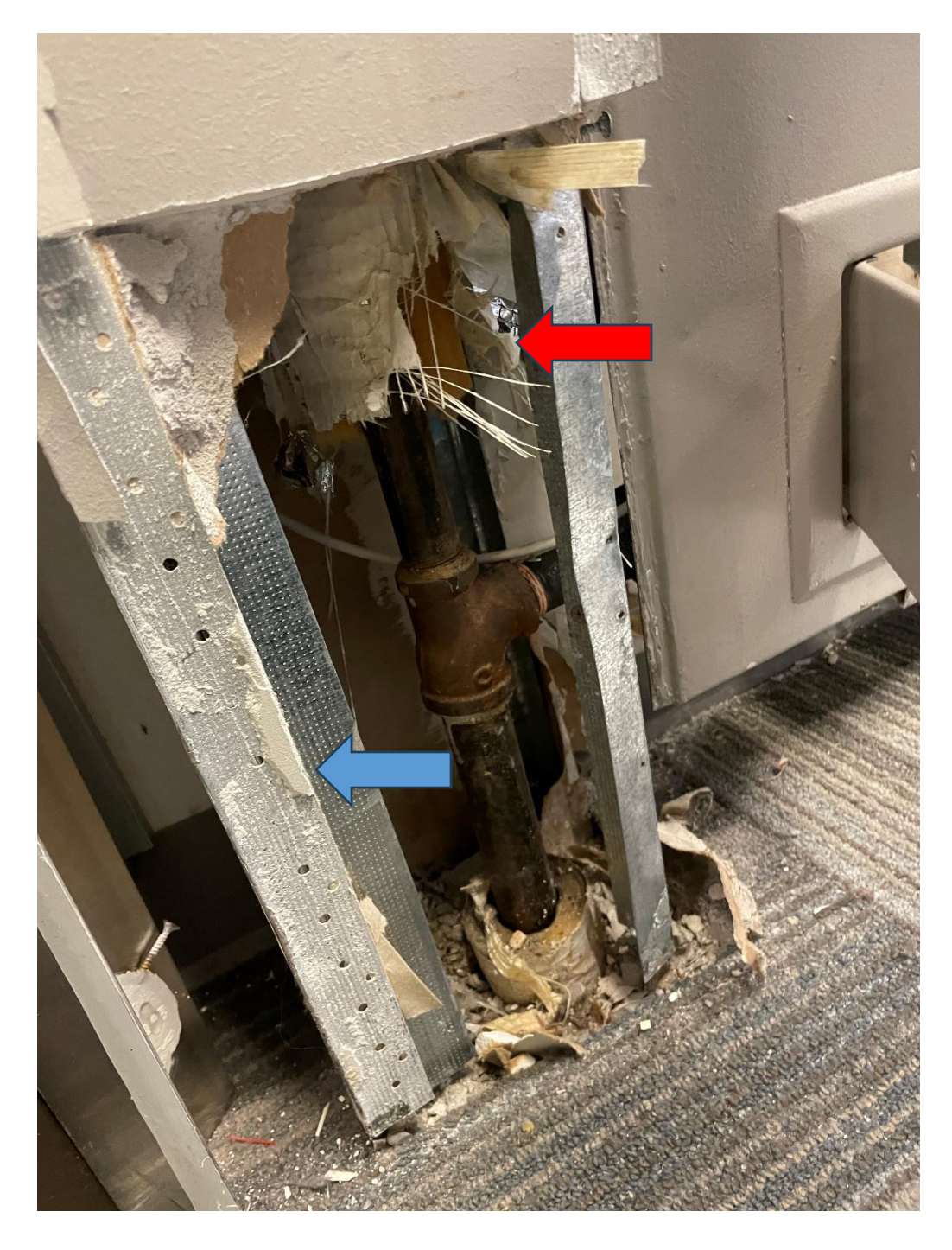
Figure 4: Representative photograph of drywall joint compound (blue arrow) observed in "Poor Condition" on the 2nd Floor at pipe penetrations. Drywall joint compound was sampled and confirmed to be non-asbestos containing (Sample ID: AS-04A-C). Fibreglass insulation (red arrow) was sampled as per client request and confirmed to be non-asbestos containing (Sample ID: AS-06A-C).