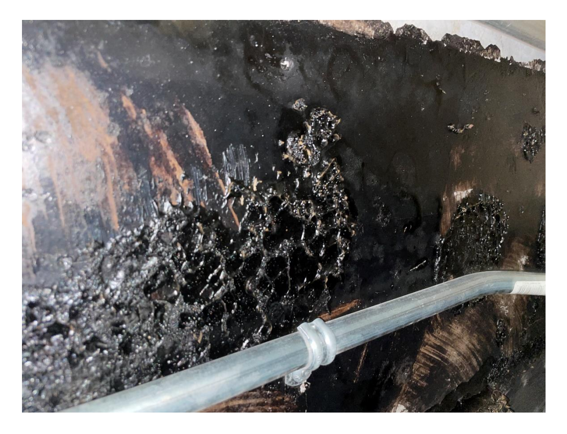
Figure 2: Representative photograph of non-asbestos containing black tar on cork board observed within the 2nd Floor ceiling space (Sample ID: AS-02A-C).