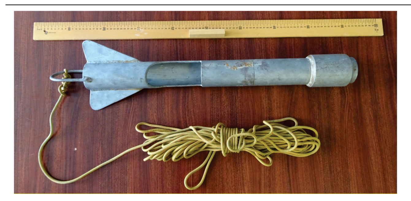
Figure 1. Lake sediment sampler used at the Geological Survey of Canada. The device weighs 7.1 kg and collects a 30 cm core sample of lake sediment, corresponding to a weight of 1.2 kg of lake sediment.

Field observations are entered into the iPad digital template while the helicopter is on the site and should be completed before departure for the next site. When the helicopter has landed in the centre of the lake and has become stationary, the sediment sample-collecting member of the crew kneels on the plywood deck attached to the float tubes and proceeds to collect the water and sediment samples. The water sample must be collected first, before the water adjacent to the helicopter is contaminated by bottom sediment from the sediment sampling apparatus. One 250-ml HDPE bottle is triple-rinsed on-site with lake water then used to collect lake water for later preparation of two 60 mL samples back in camp: a filtered, acidified sample ('FA') and a filtered, un-acidified sample ('FU'). A lake water sample is collected 15-30 cm below the surface, will not contain surface debris, and will be as devoid of suspended material as possible. Lake water bottles must be full to the top of the shoulder. Do not fill to maximum capacity i.e., into the neck of the bottle. Visual observations (colour, clarity, suspended material) are recorded on the digital lake field card ('Water Sample' tab).